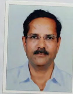
Partner – 2