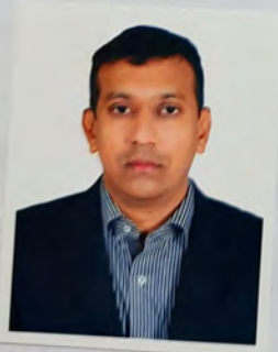
Partner – 1