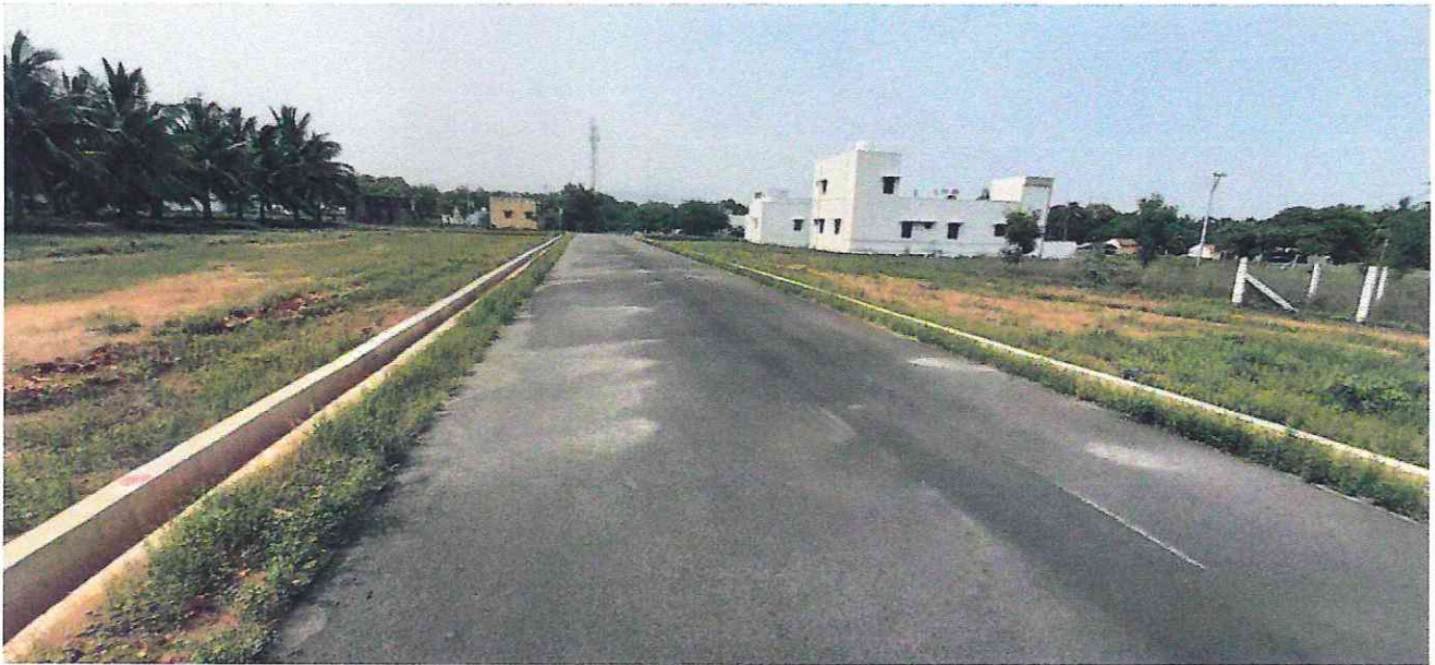
“SHIVA MURUGAN NAGAR”, Survey Number - 233/1A2B, Mallasamudram Melmugam Panchayat/Village, Tiruchengode Taluk, Namakkal District and Tamilnadu.