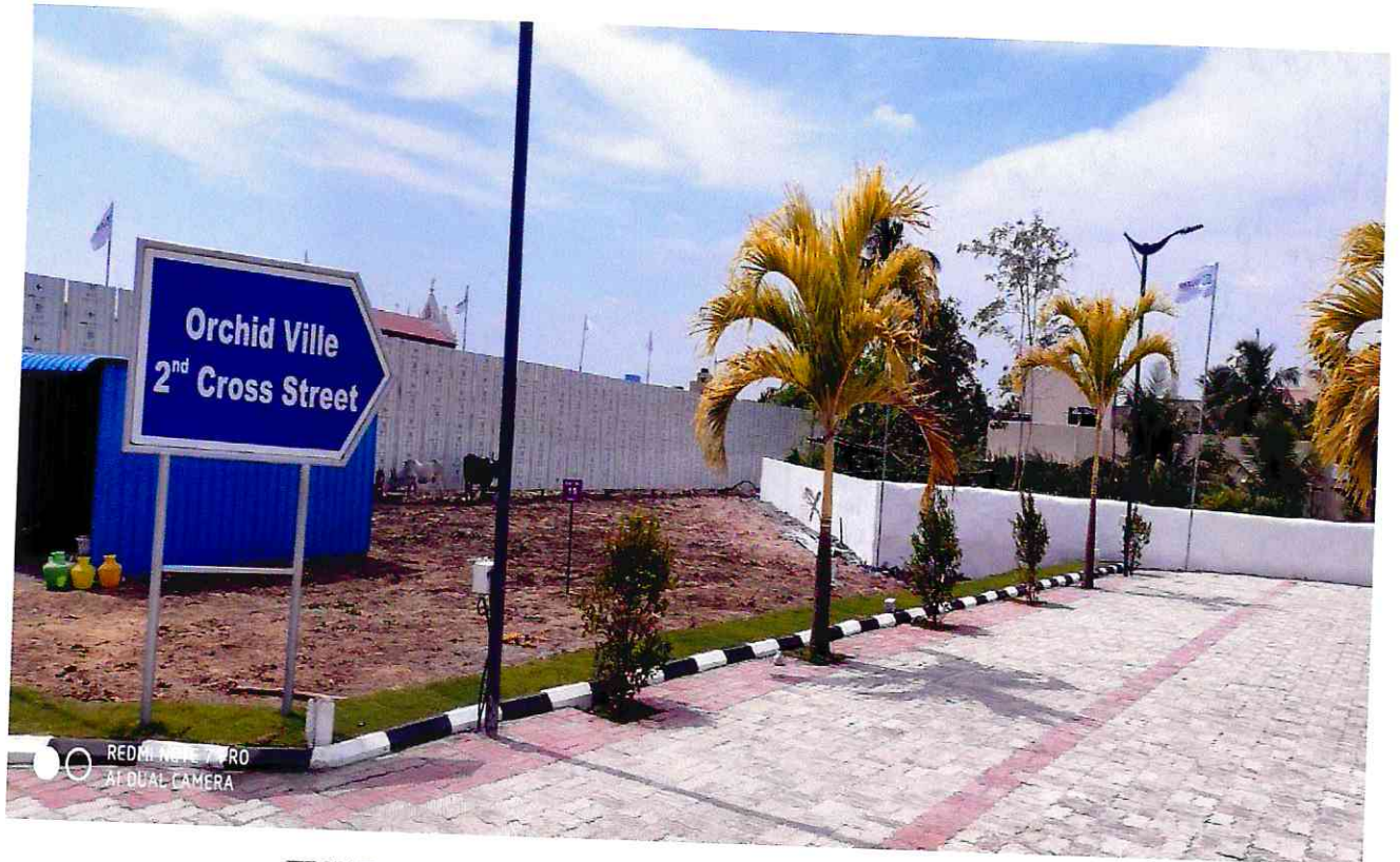
FIGURE:3: ROADS WITH ROAD NAME BOARD