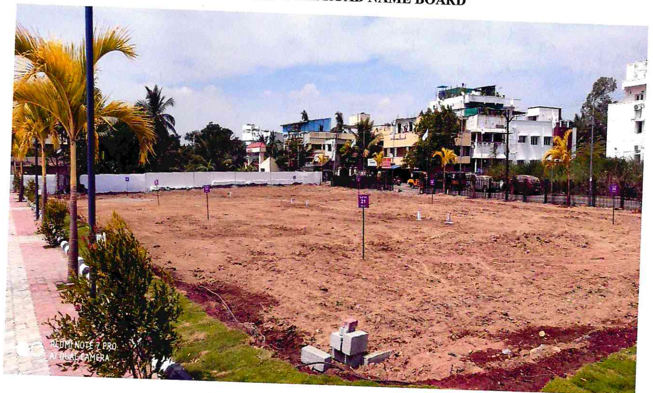
FIGURE: 4: PLOT MARKING AT SITE