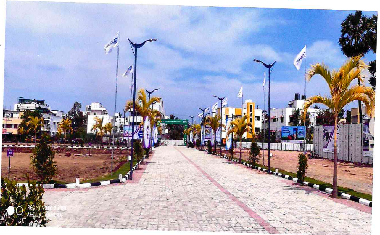
Figure: 1: PAVEMENTS ROAD WITH KERB WALLS