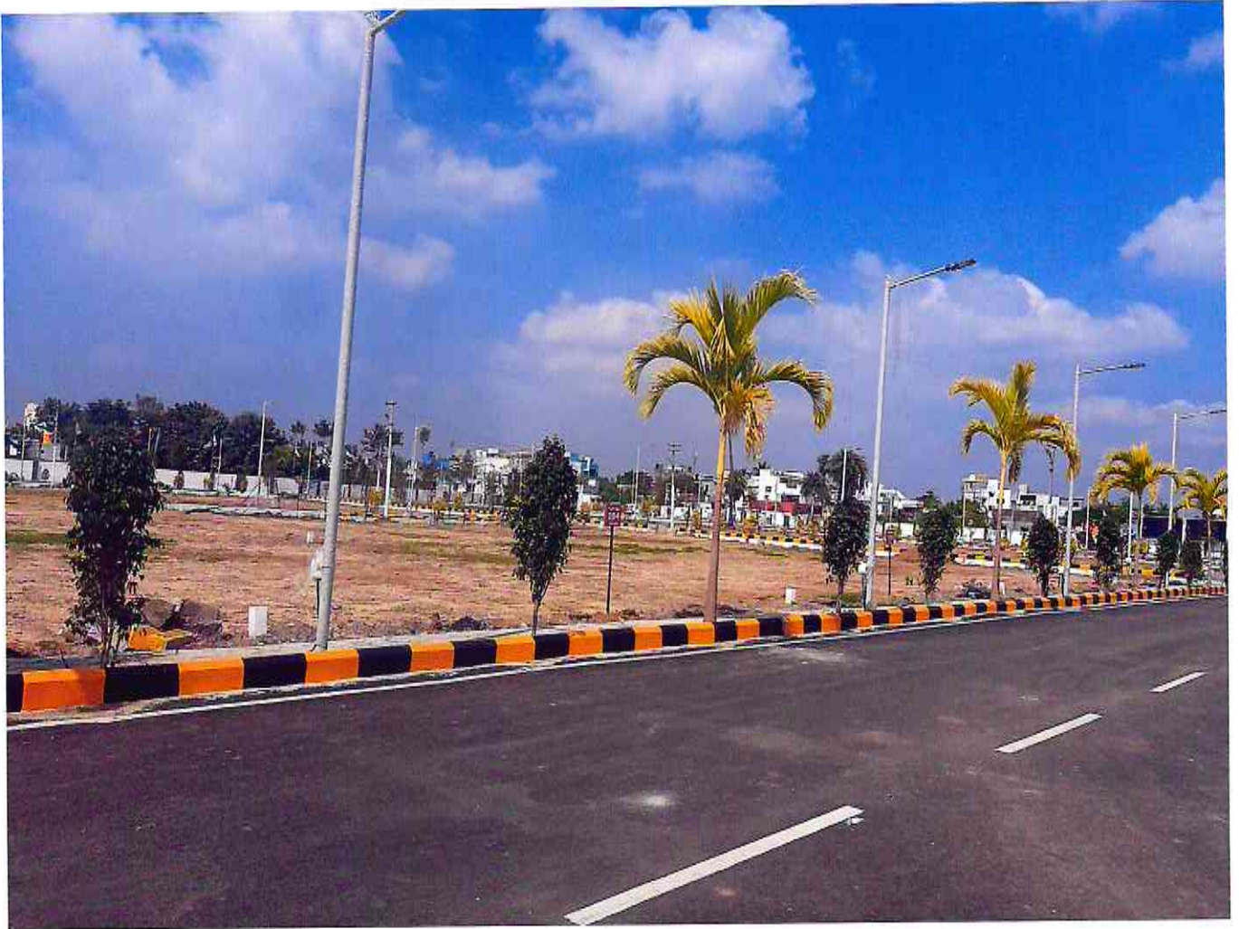
VIEW OF THE LAYOUT FROM SOUTH EAST SIDE

BLACK TOP ROADS WITH PLOT MARKING STONES