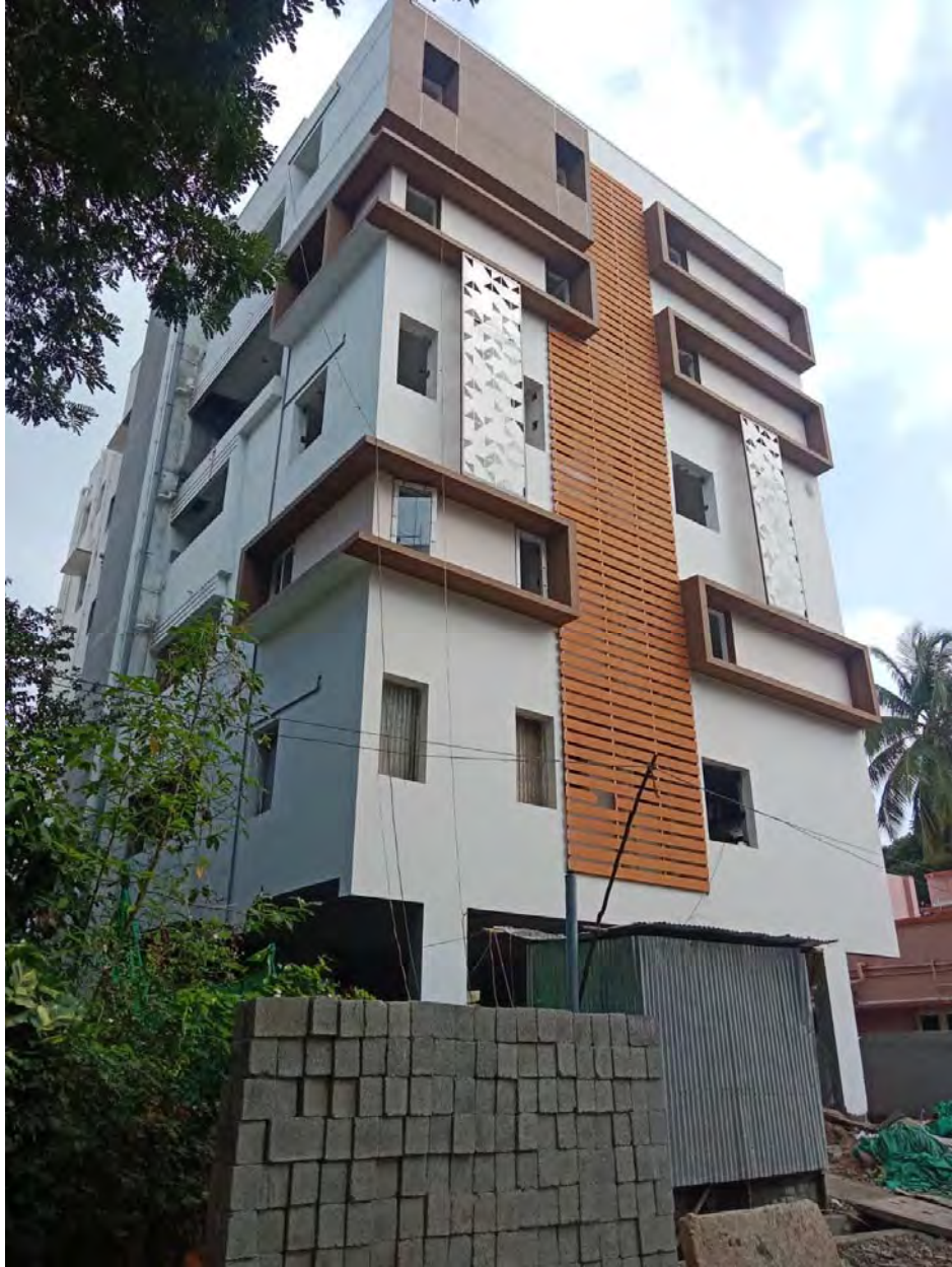
FRONT ELEVATION WORK

RERA Registration No: TN/11/Building/0089/2023 dated 21.02.2023