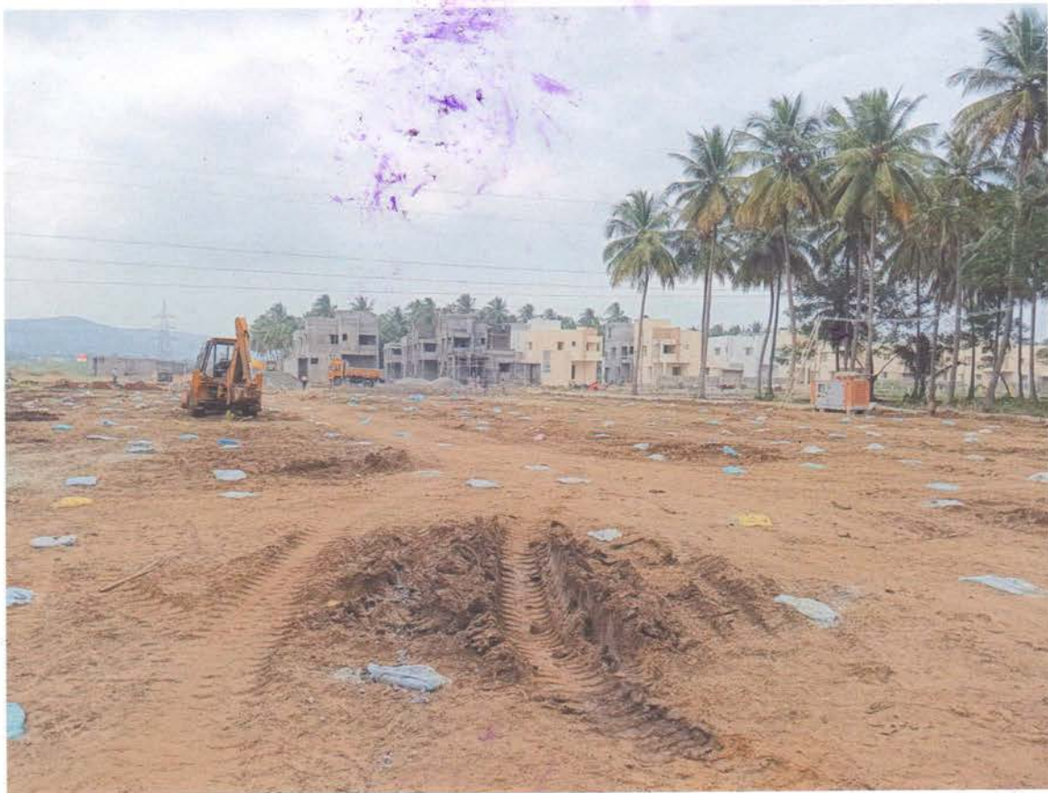
Figure 1 Foundation, Pile Cap Under Progress