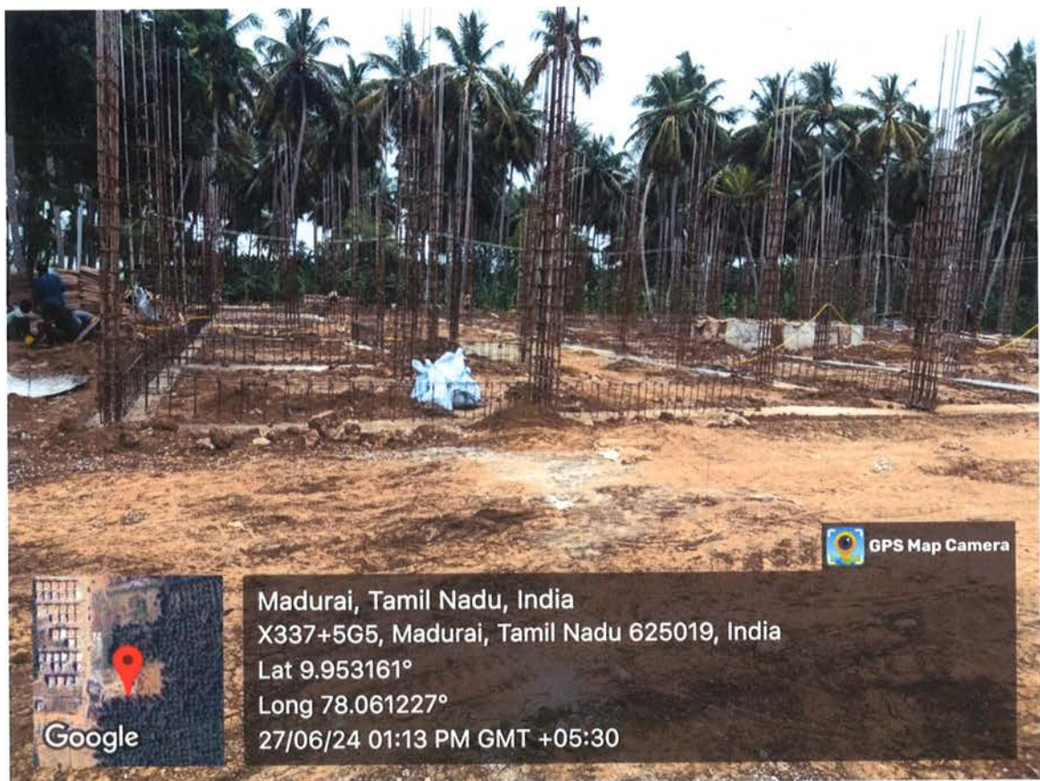
Figure 1 Foundation Completed