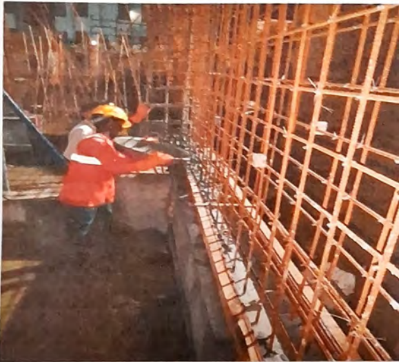
Retaining Wall reinforcement in progress