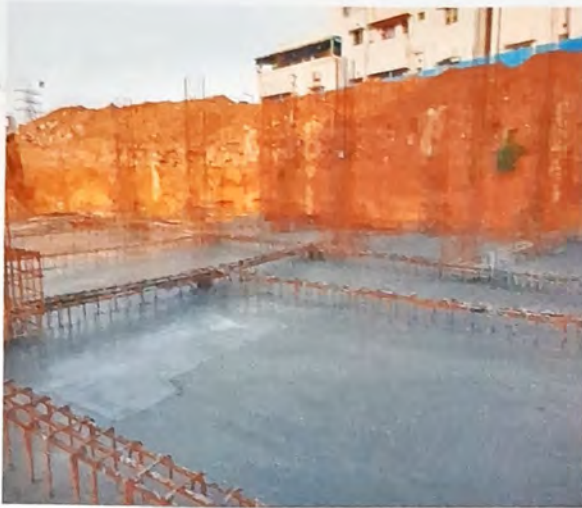
Basement Raft Slab in Progress