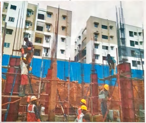
Basement Floor Columns in progress