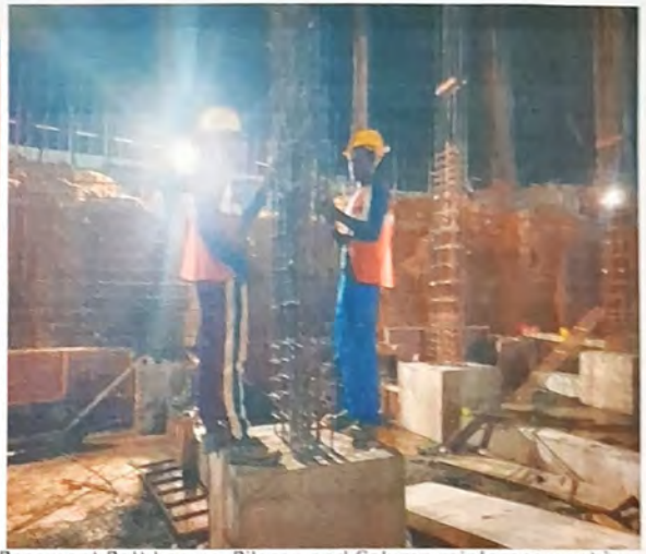
Basement Raft beams, Pilecap and Column reinforcement in Progress