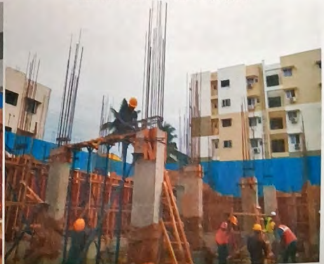
Basement roof beam Shuttering Started