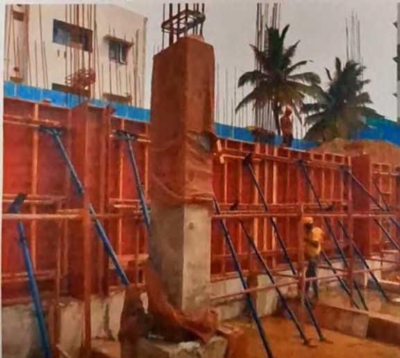
Retaining wall shuttering in Progress