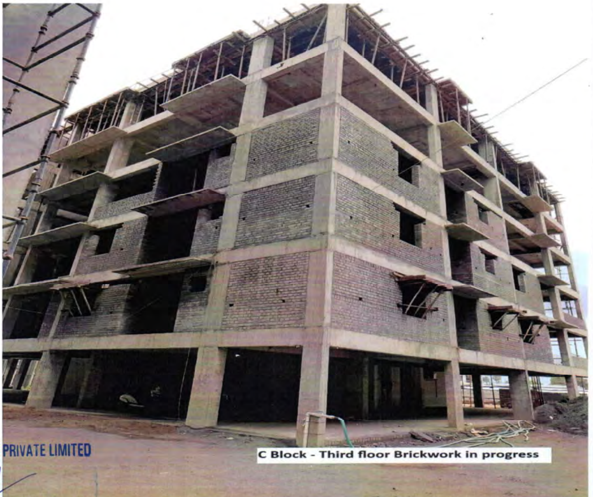
C Block - Third floor Brickwork in progress

Block - C Third floor brickwork in progress