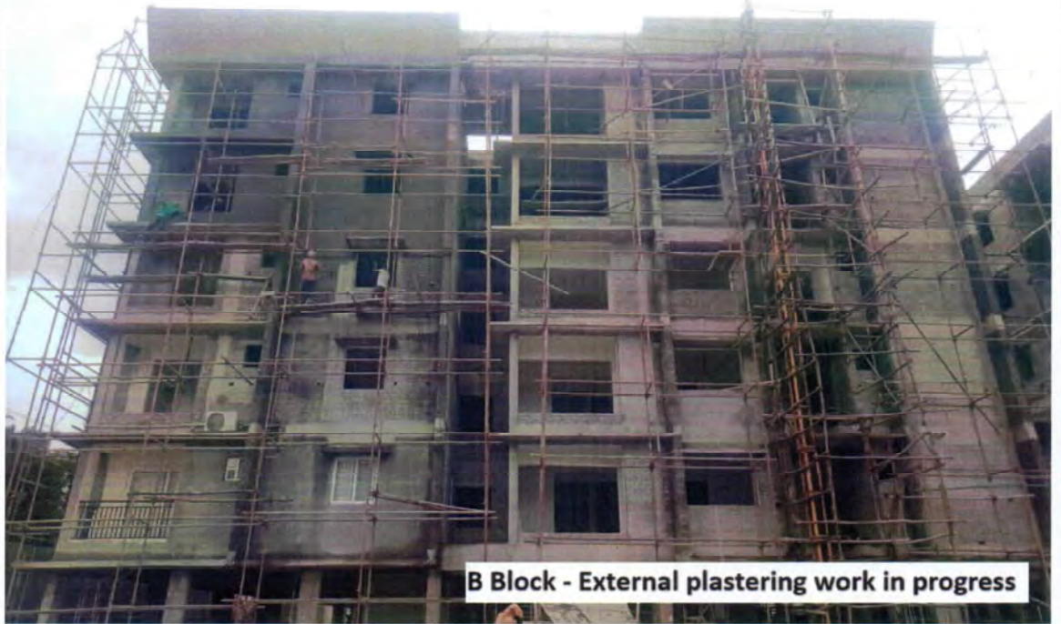
B Block - External plastering work in progress

Block - B External plastering work in progress