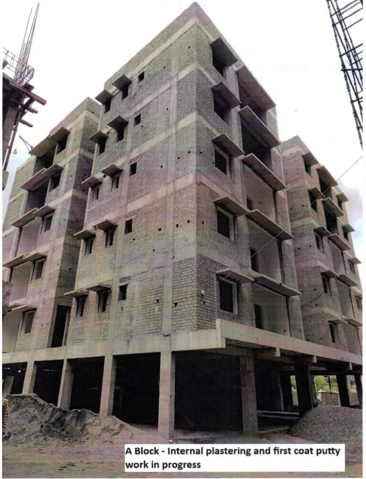
A Block - Internal plastering and first coat putty work in progress

Internal plastering and first coat putty work in progress