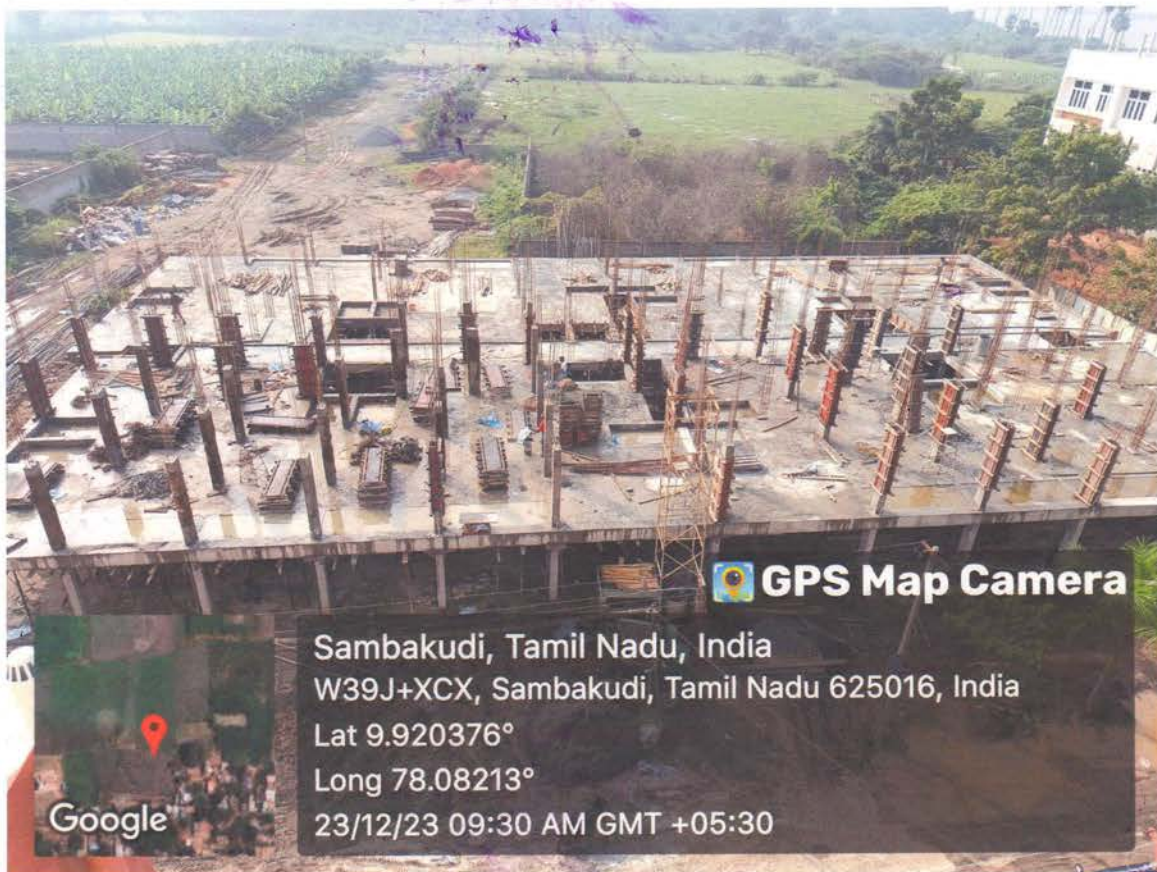
Figure 1: Ground Floor Roof Completed