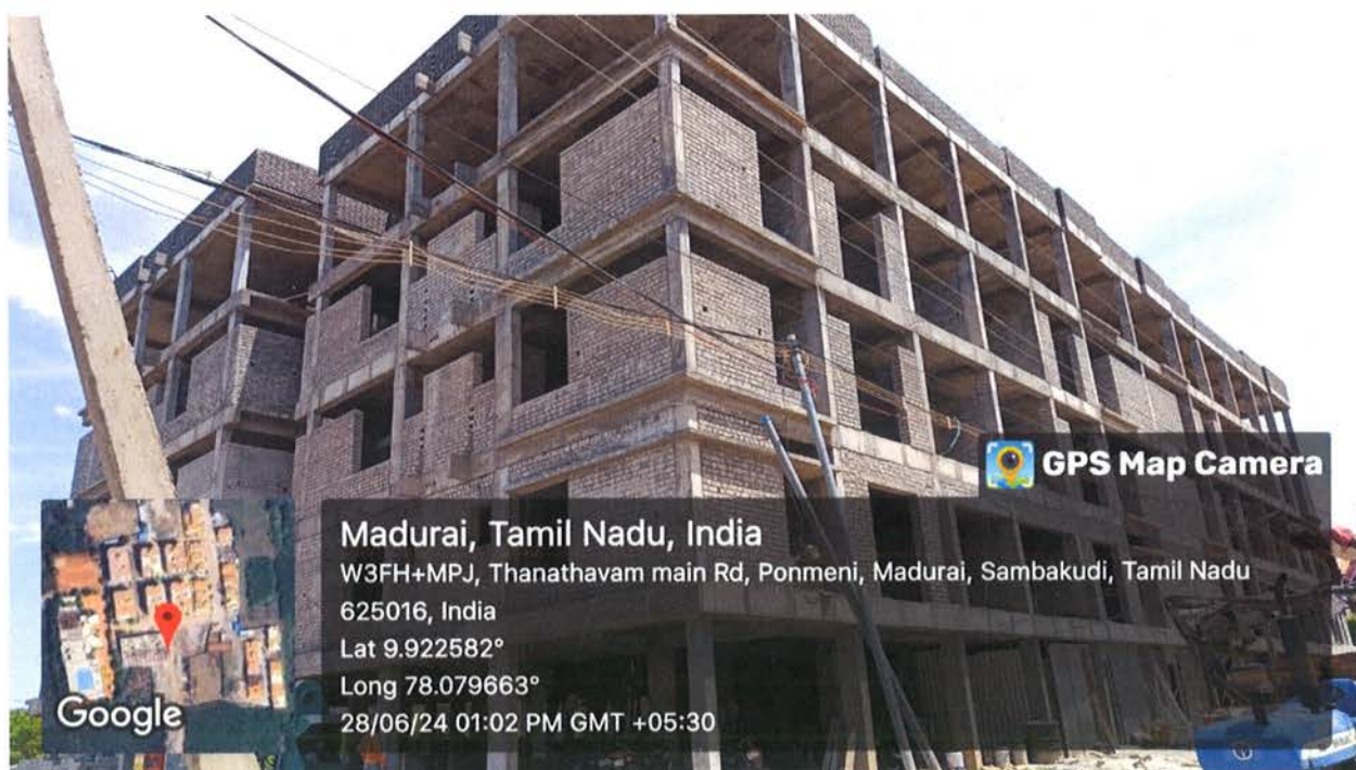
Figure 1: Fourth Floor Roof Completed