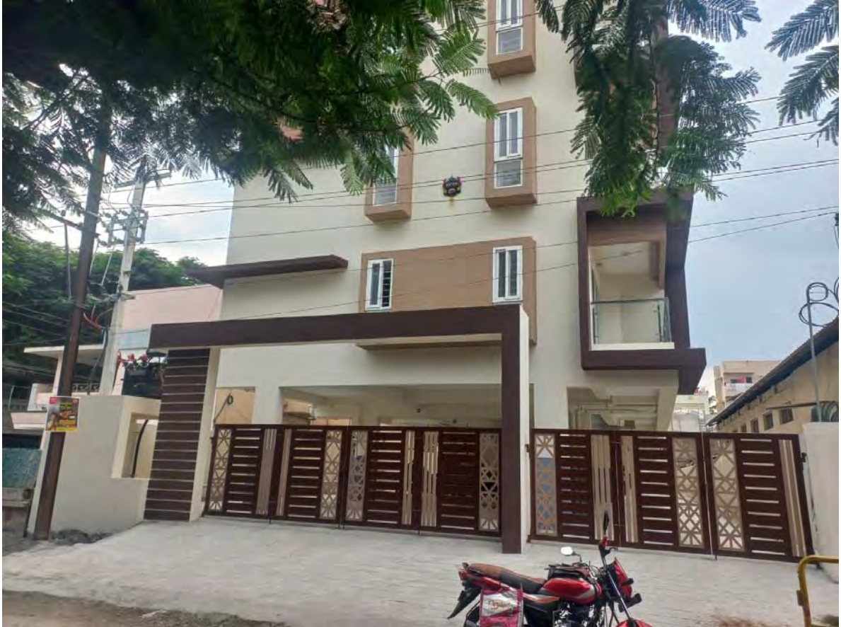
FRONT ELEVATION WORK

RERA Registration No: TN/11/Building/0051/2022 dated 08.02.2022