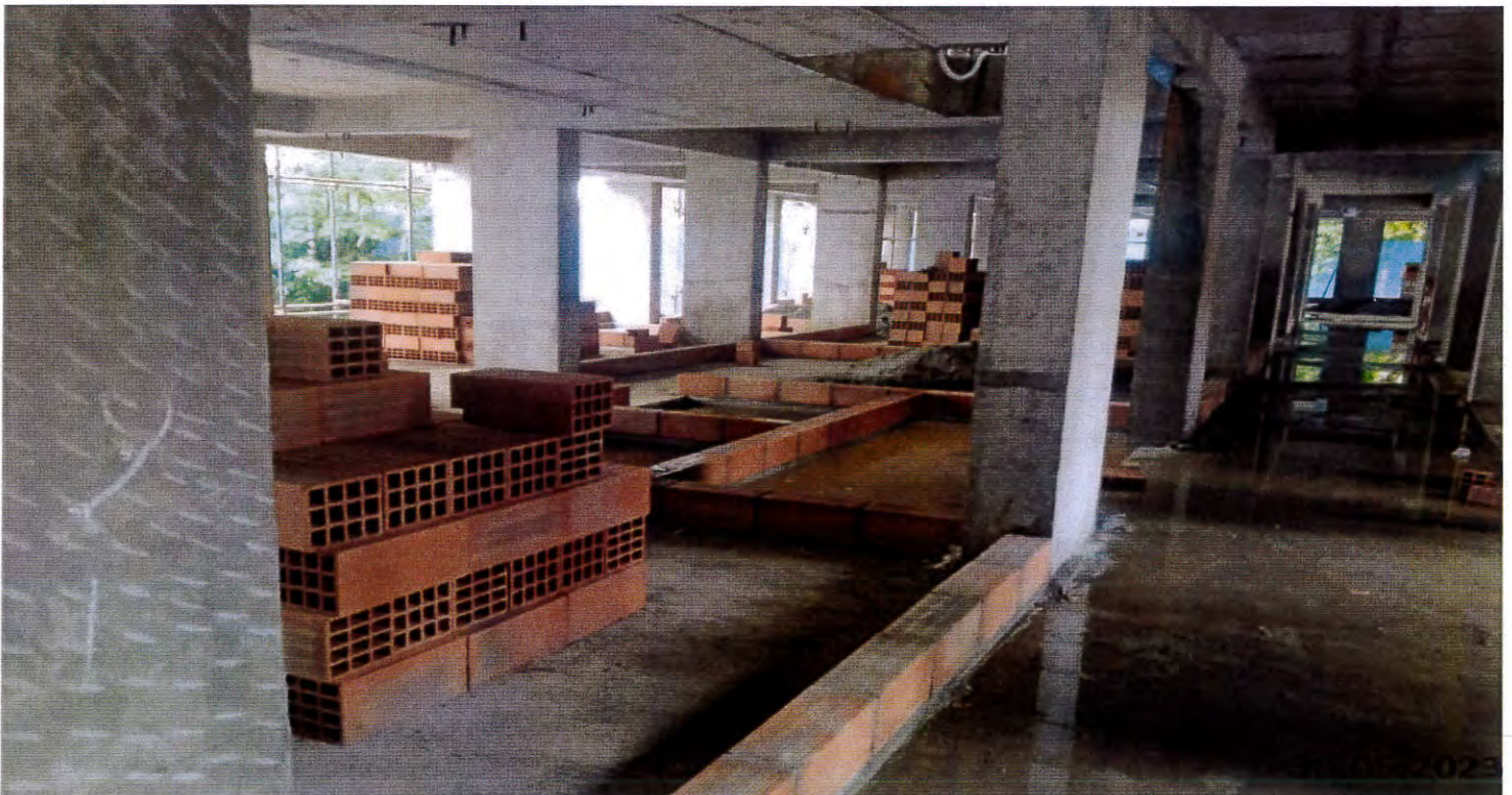
First floor Block work is in progress