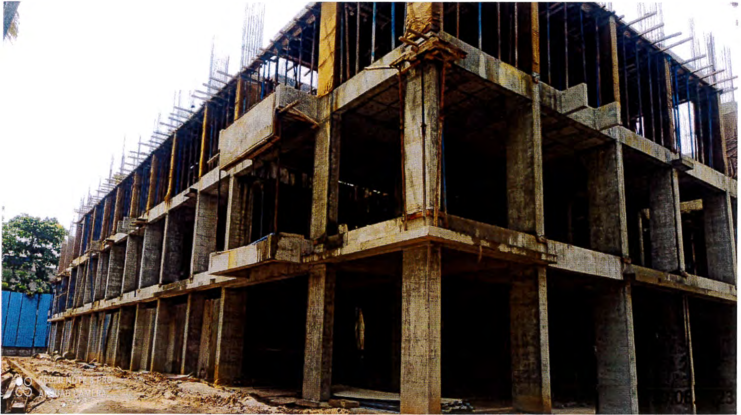
Third floor column concrete work is in progress