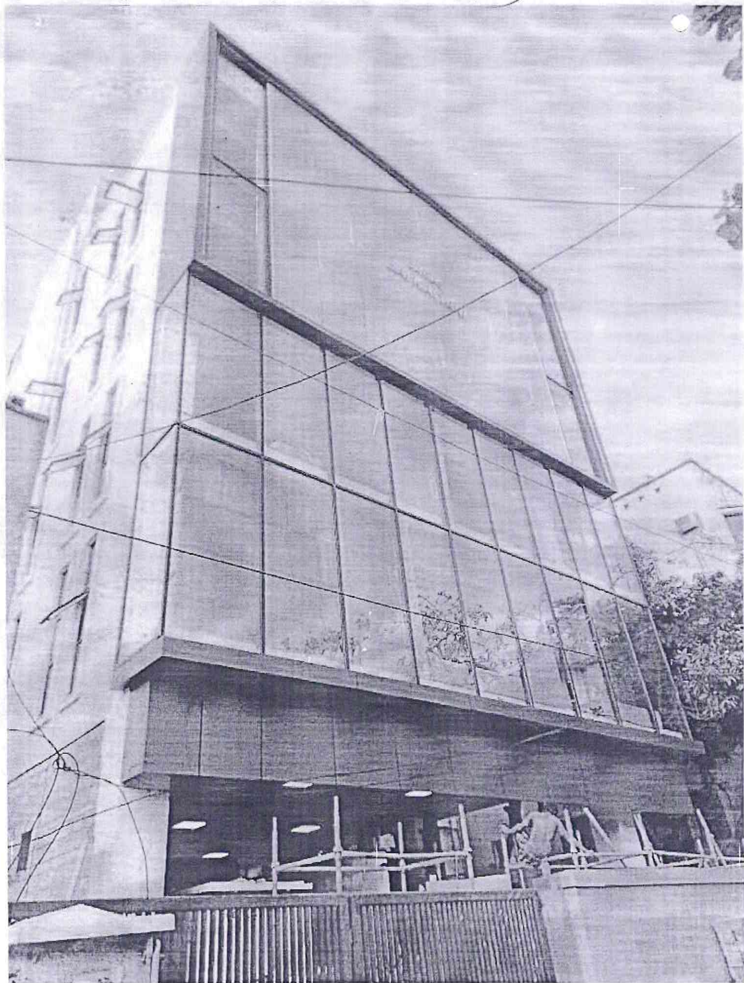
D. Latest photo (one angle)