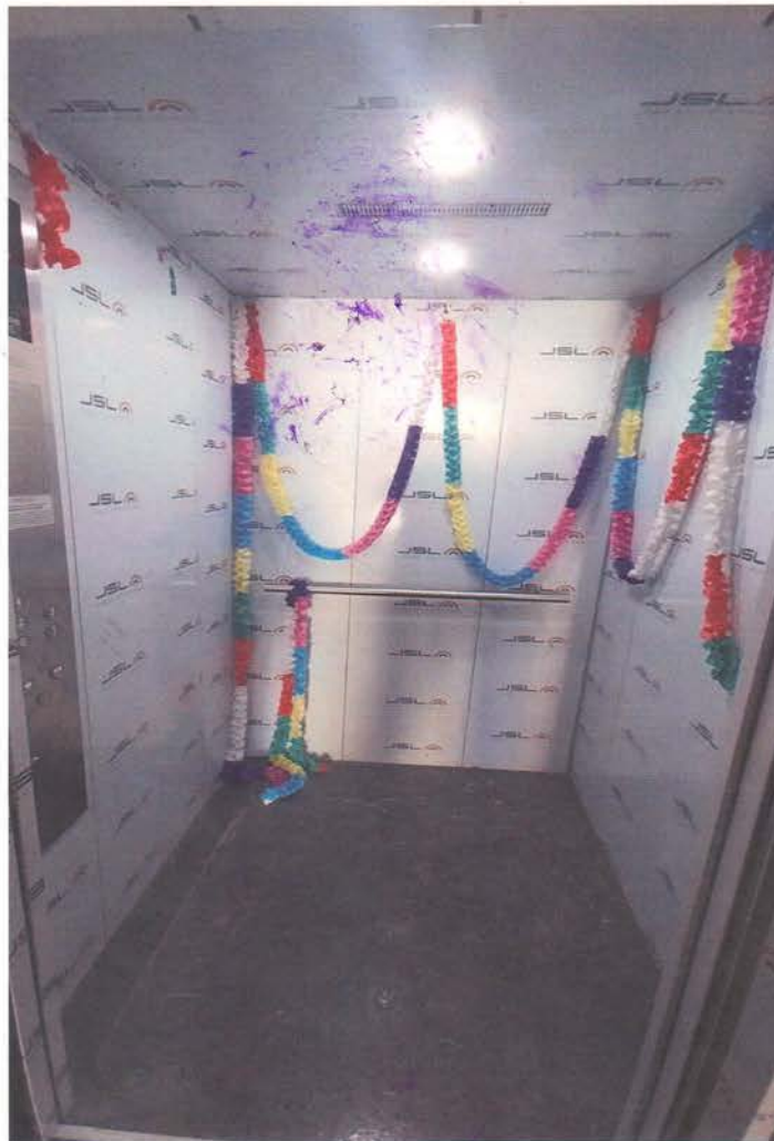
Figure 2: Lift Installation under Progress