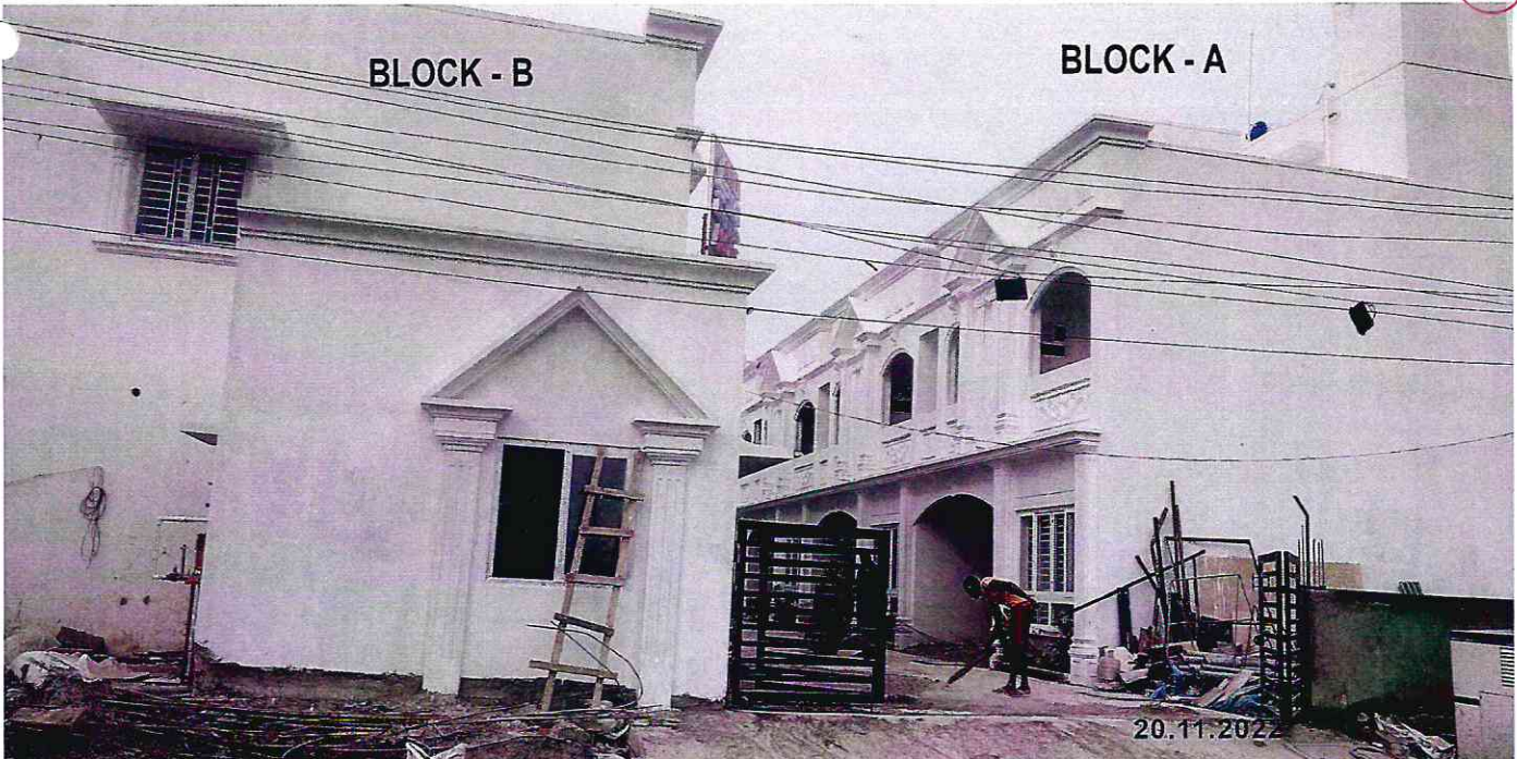
BLOCK - B