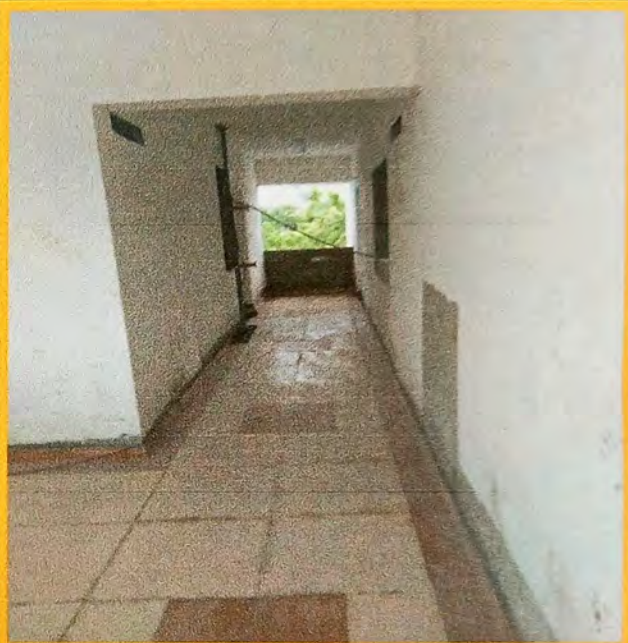
Corridor Tiling Works are Completed