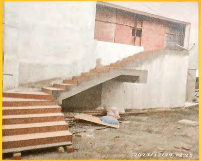
Stair Case to Gym Room