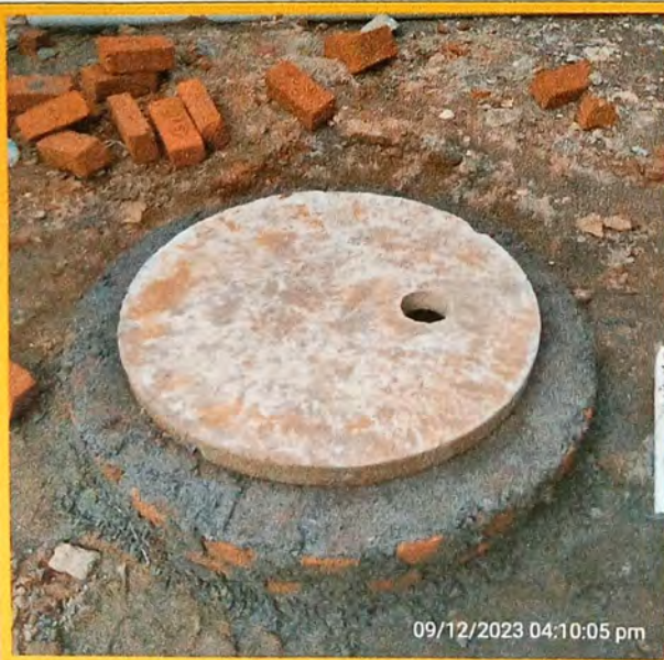
External Chambers Construction Work Under Progress