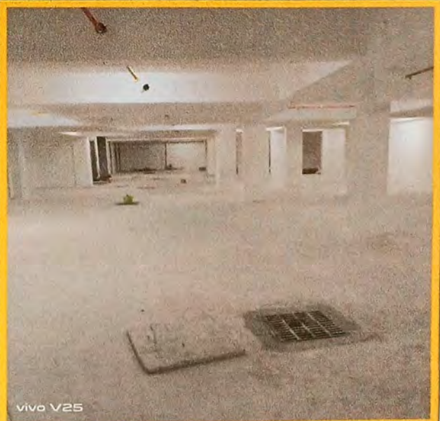
Grano Flooring Work is Completed