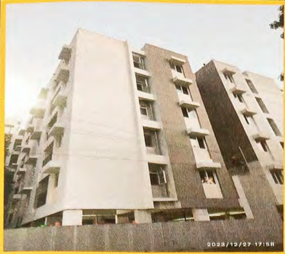
External Painting Under Progress