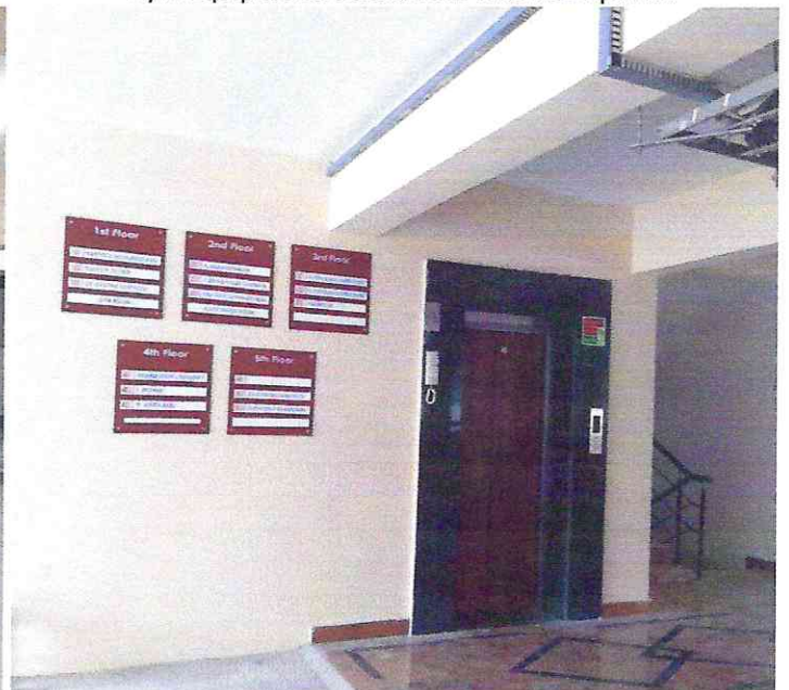
Name Board Work Completed