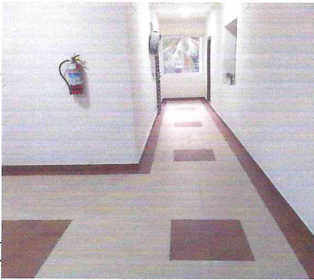
Deep Cleaning Work Completed