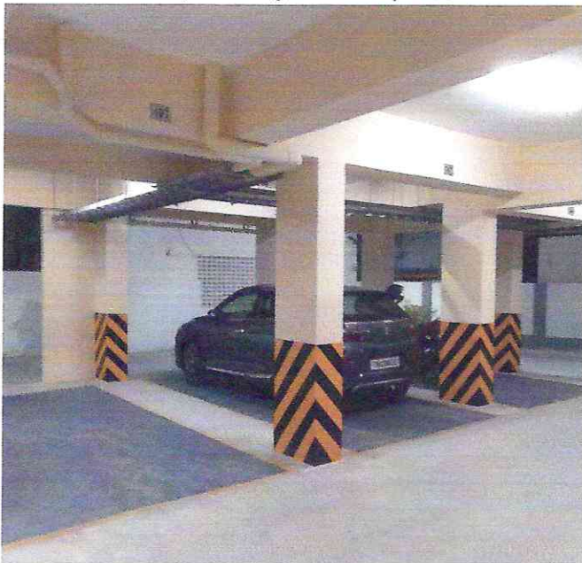
Car Park Marking Completed