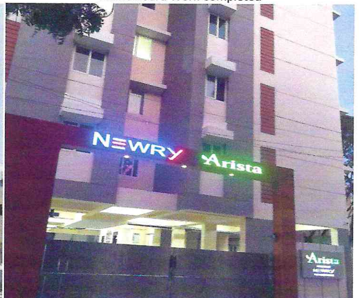
Entrance - Shera Plank Name Board Work Completed