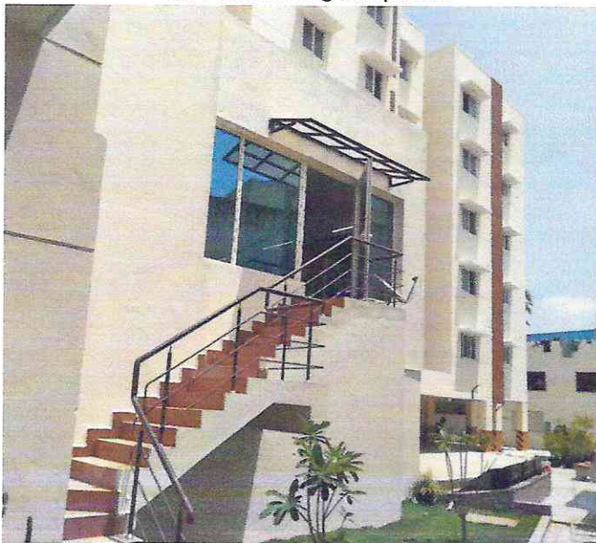
Planter work & Back side Staircase Handrail work Completed