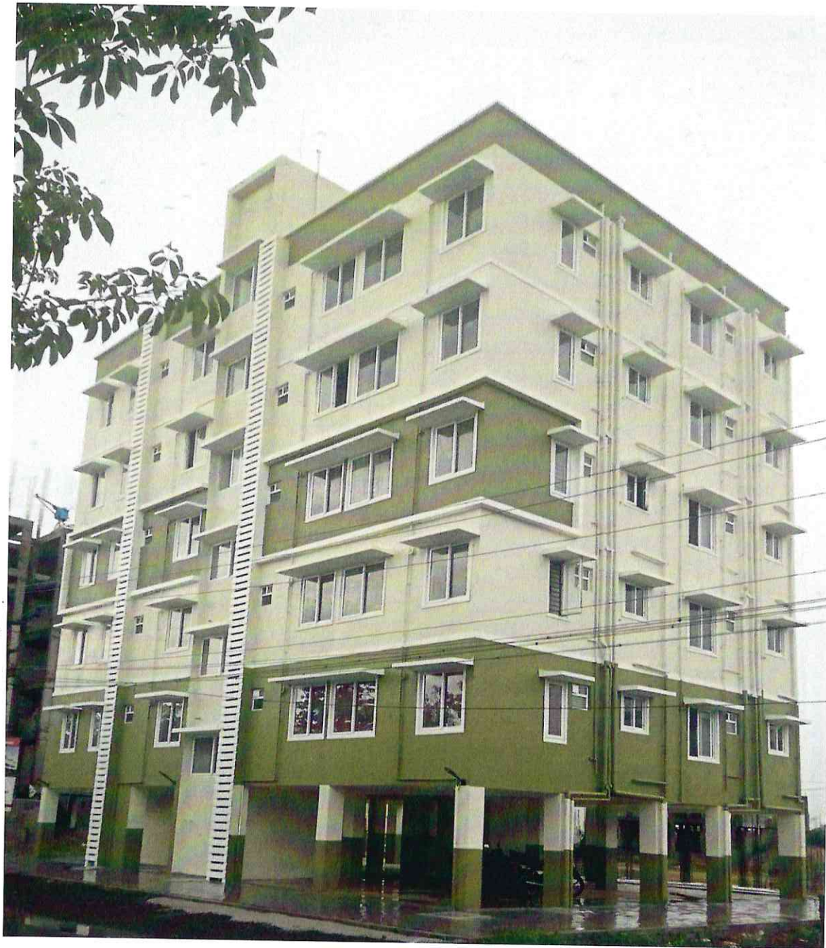
Block -6 South side