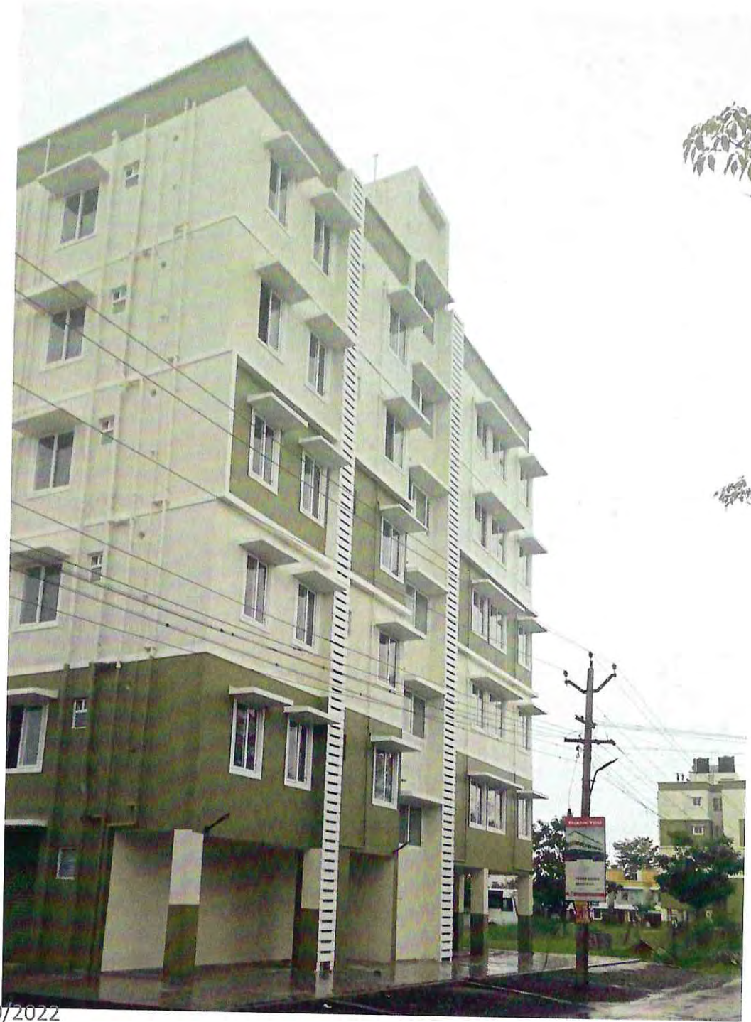
Block – 6 – West Side Elevation