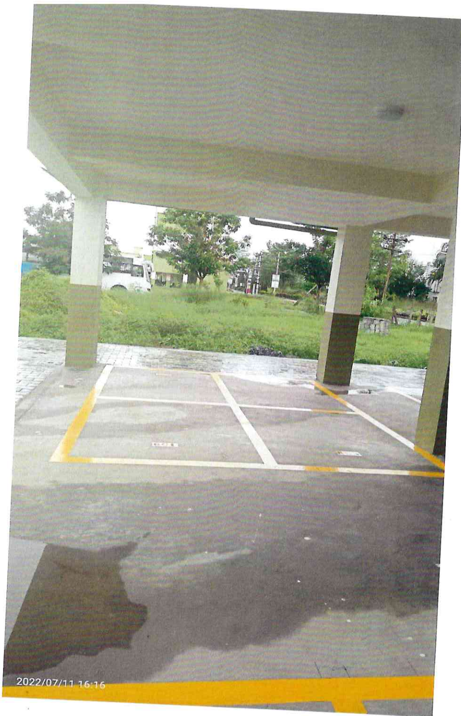
Block -6 - Stilt floor – parking slot completed