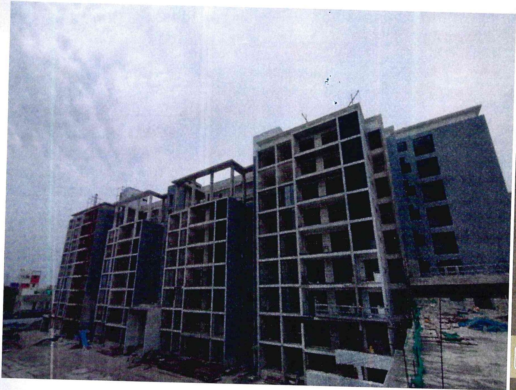
A block – North Elevation