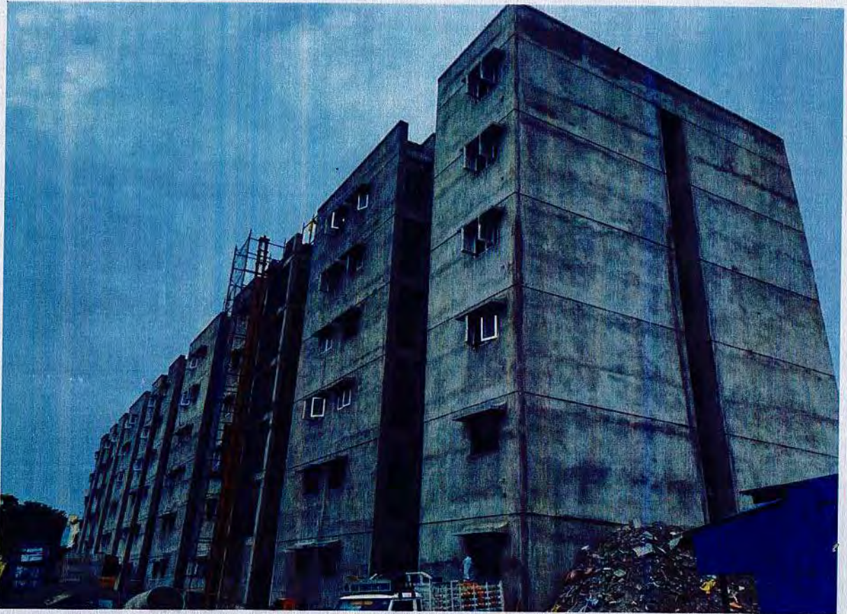
BLOCK A – REAR VIEW TOWARDS ENTRANCE