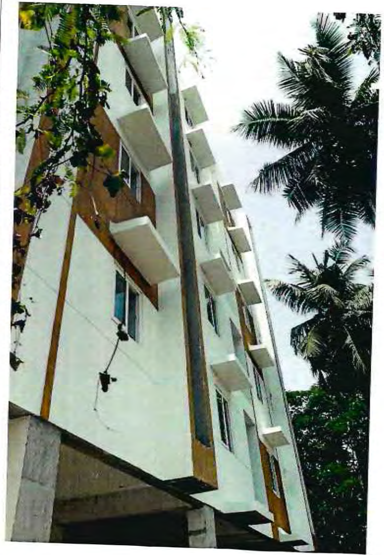
BLOCK-D SOUTH ELEVATION