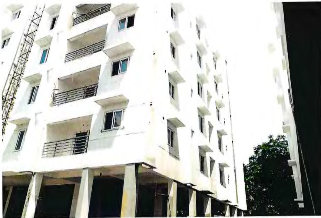
BLOCK - A EAST ELEVATION