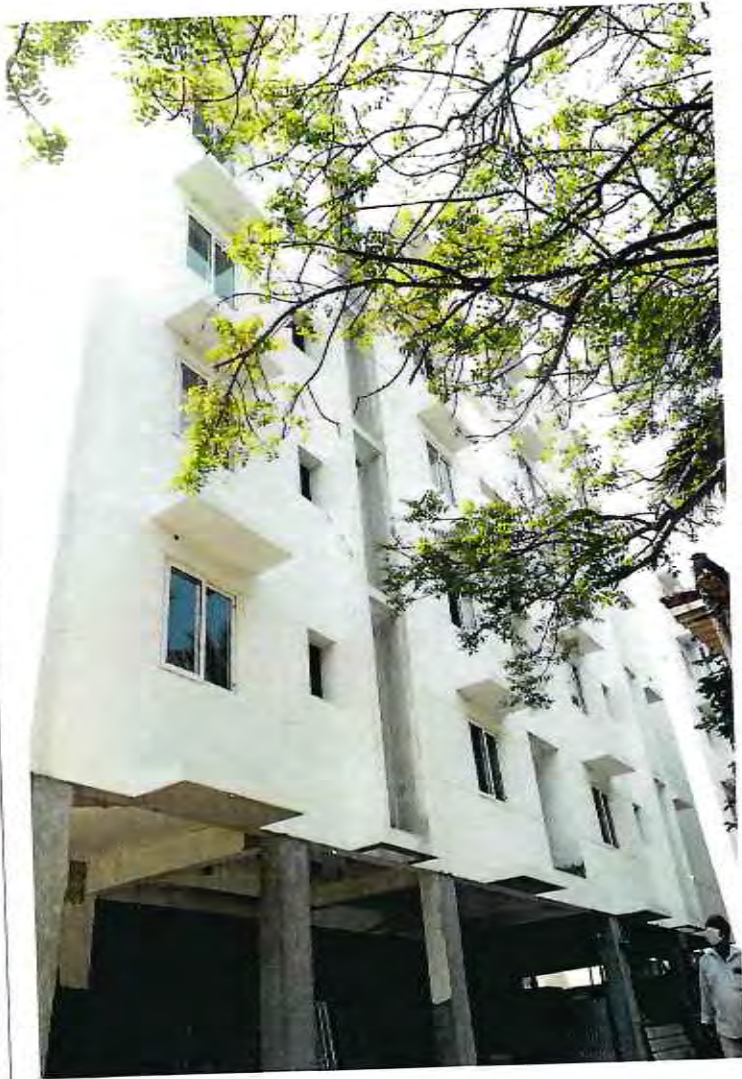
BLOCK-B NORTH ELEVATION