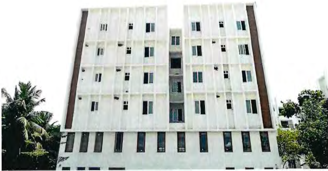
BLOCK - A WEST ELEVATION