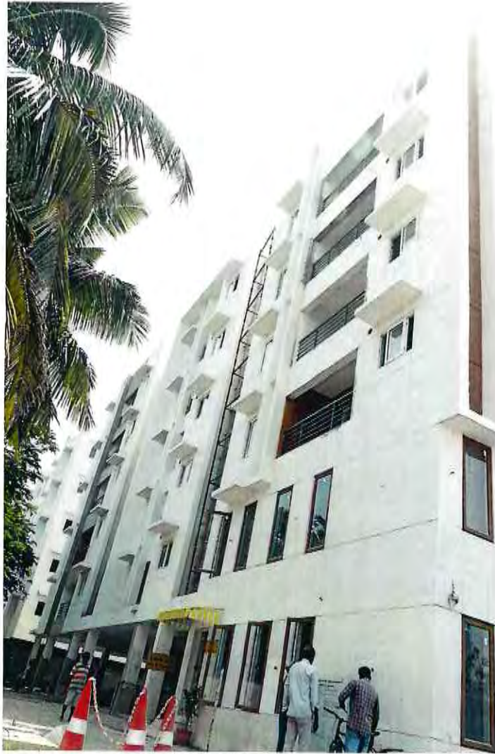
BLOCK - A NORTH ELEVATION