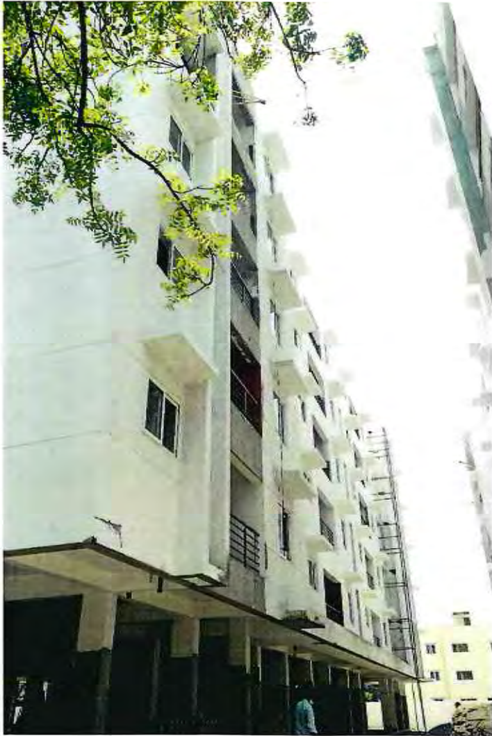
BLOCK - C EAST ELEVATION .