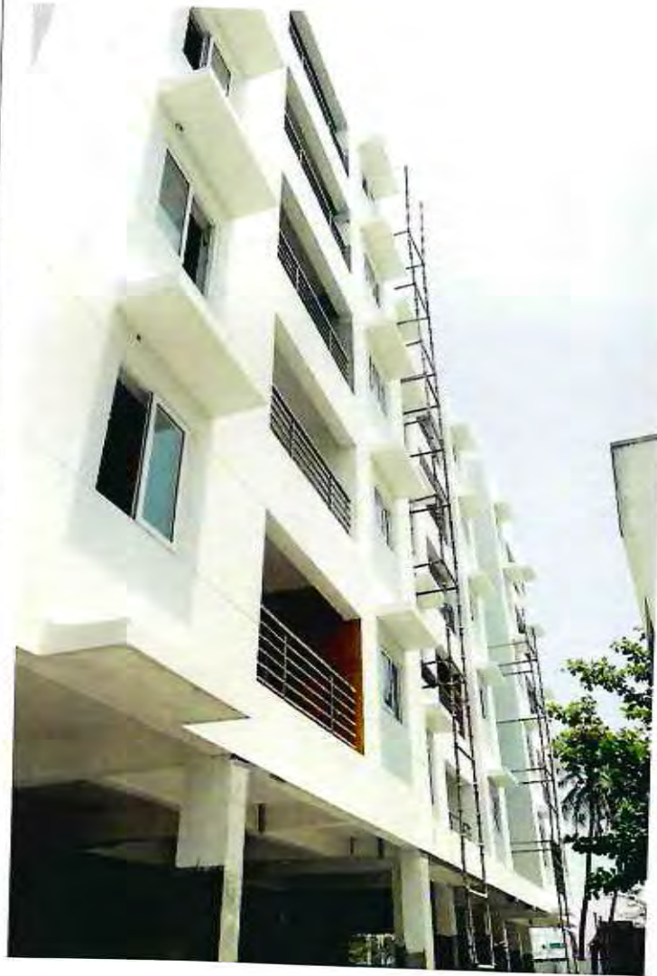
BLOCK - D WEST ELEVATION