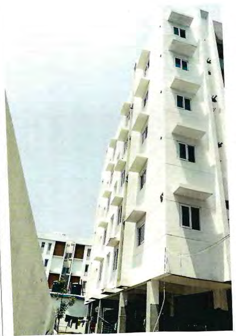
BLOCK-B SOUTH ELEVATION