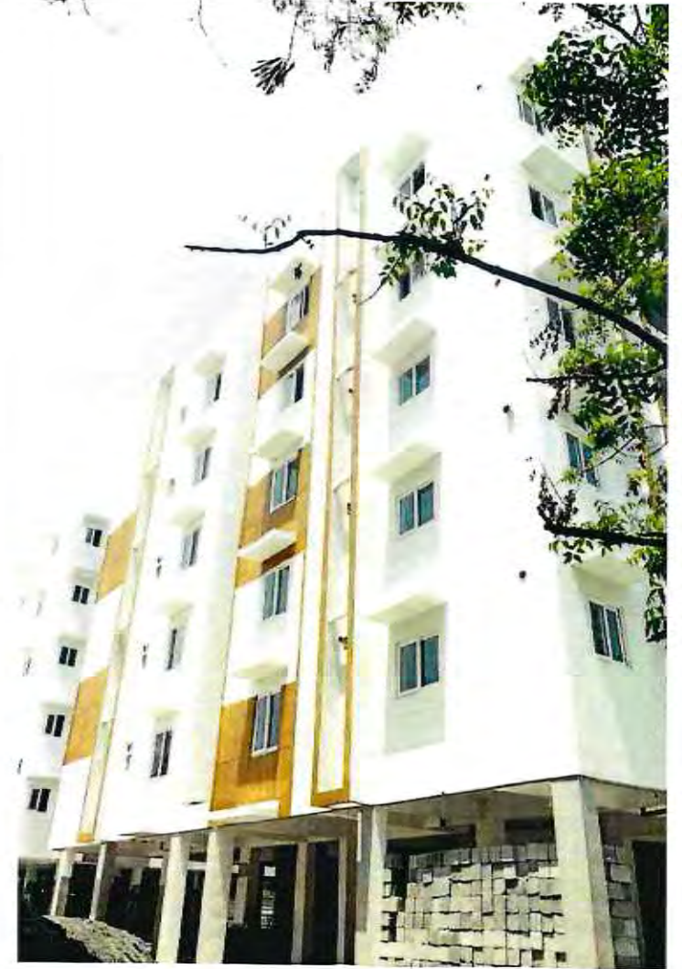
BLOCK - C NORTH ELEVATION