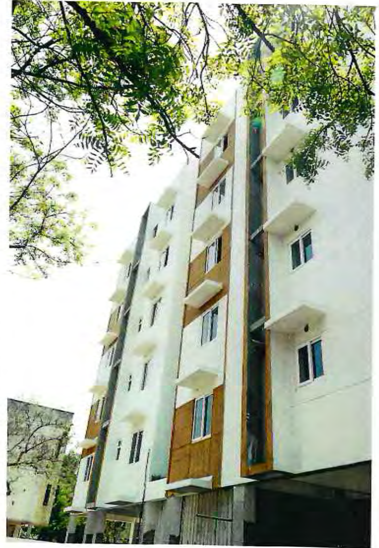
BLDCK - C SOUTH ELEVATION .