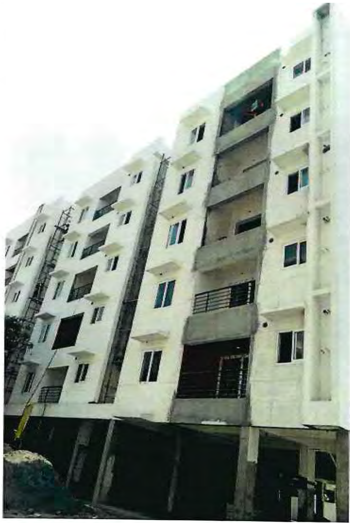
BLOCK-D NORTH ELEVATION