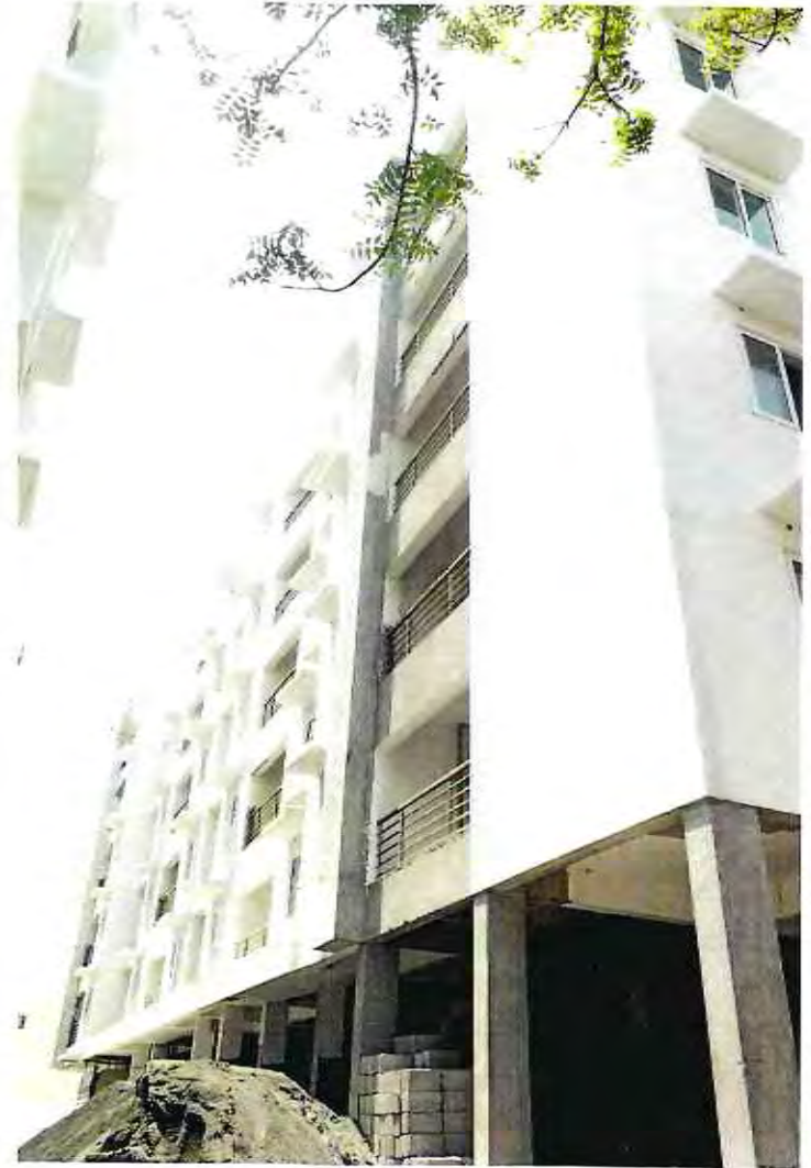
BLOCK - B EAST ELEVATION