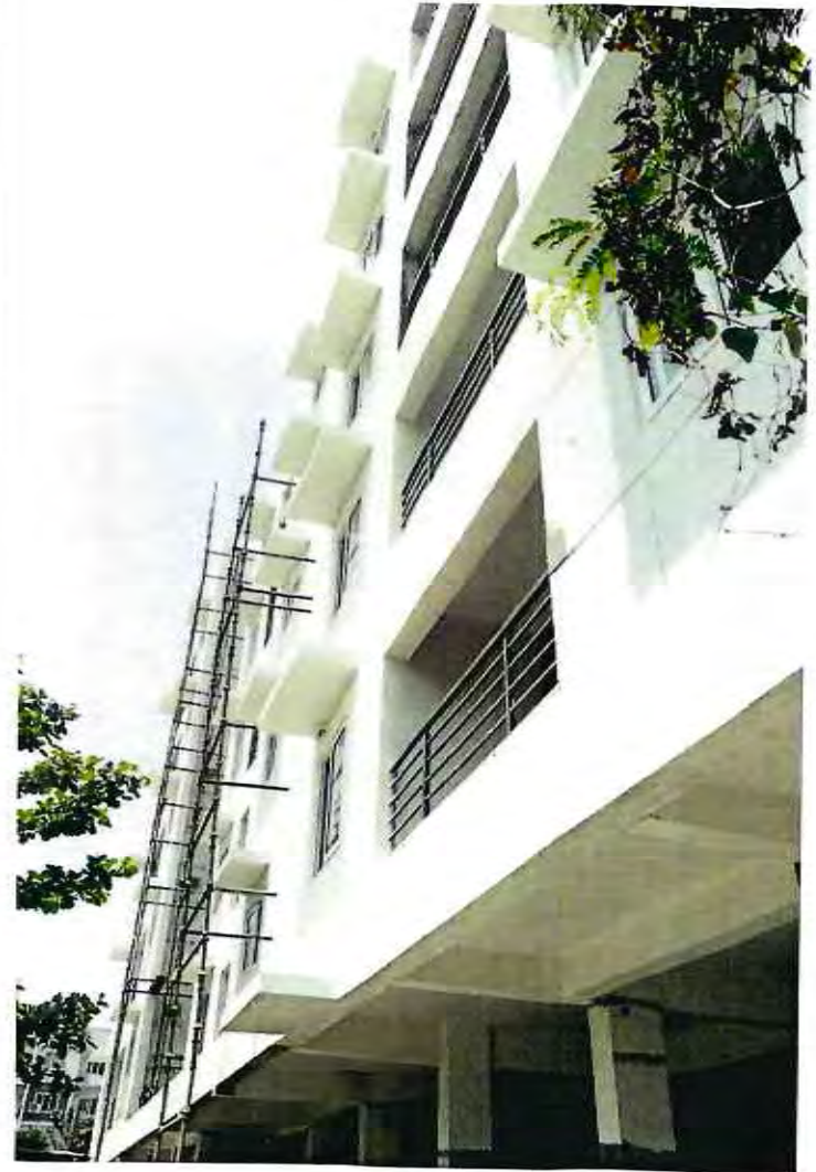
BLOCK - D EAST ELEVATION