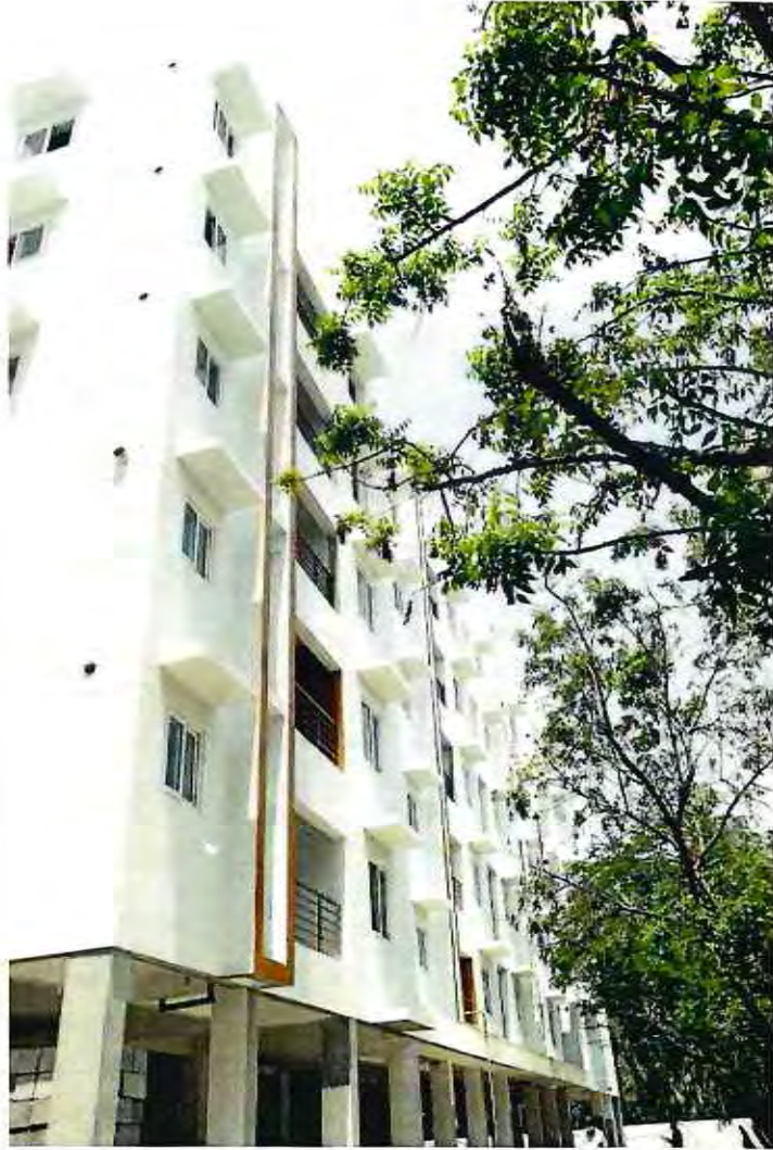
BLDCK - C WEST ELEVATION