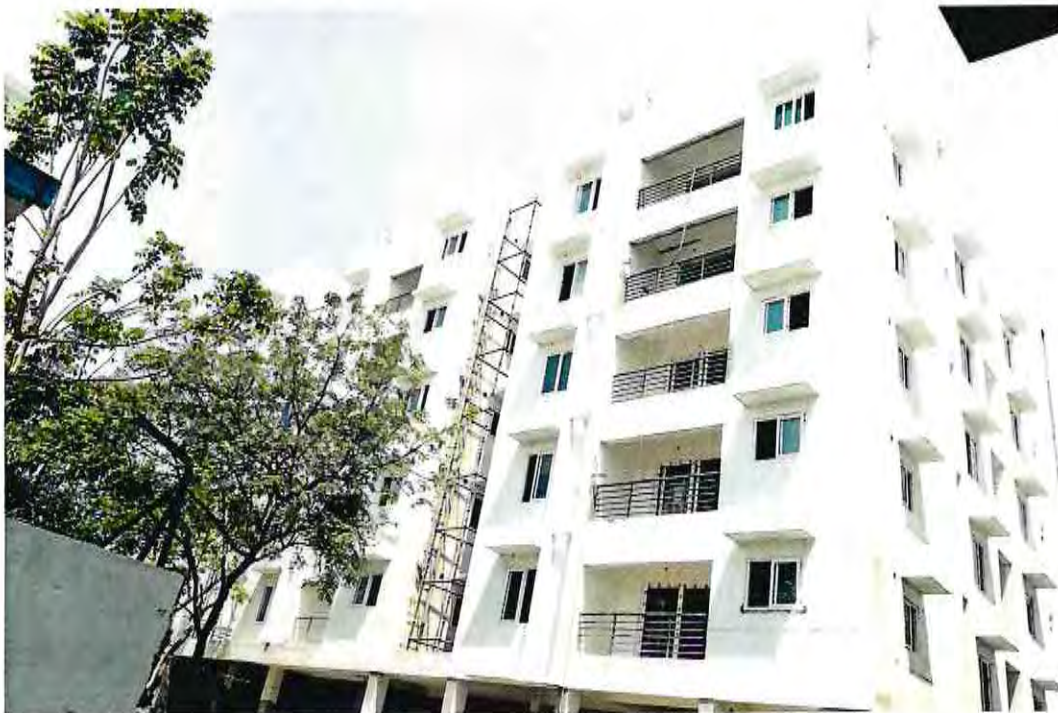
BLOCK - A SOUTH ELEVATION