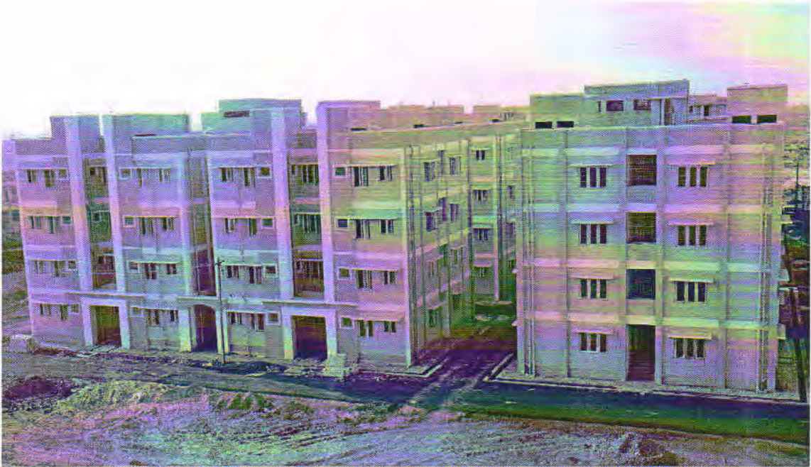
Construction of 128 Tenement at Paiyurpillaivayal II - Sivagangai