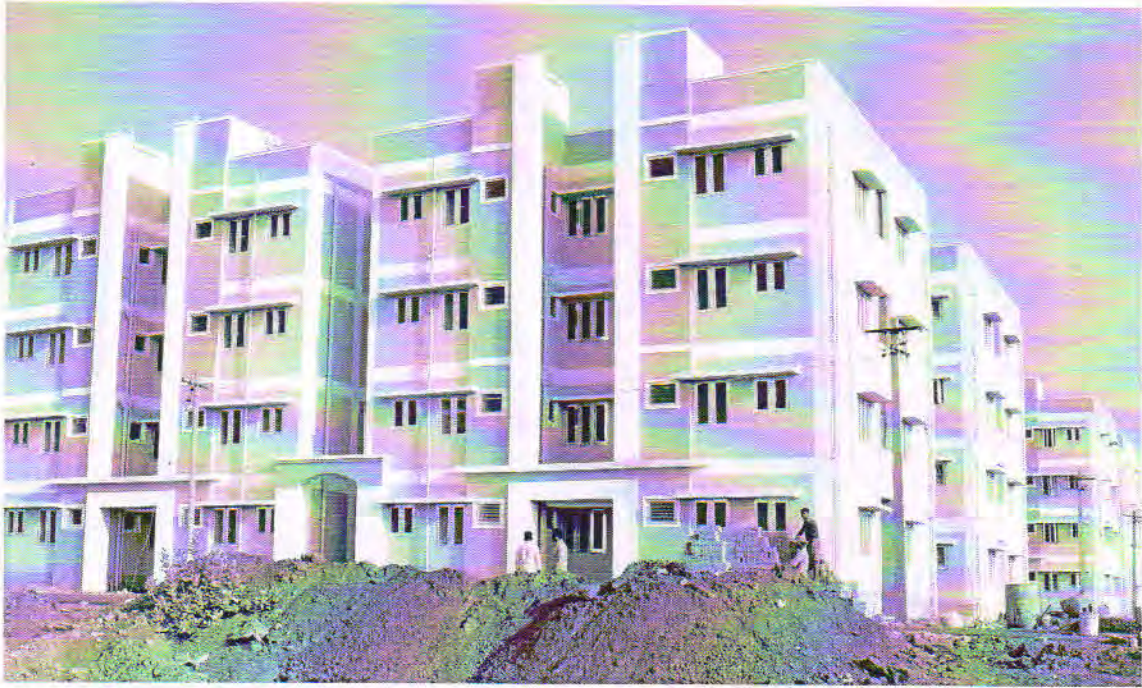
Construction of 128 Tenement at Paiyurpillaivayal II - Sivagangai