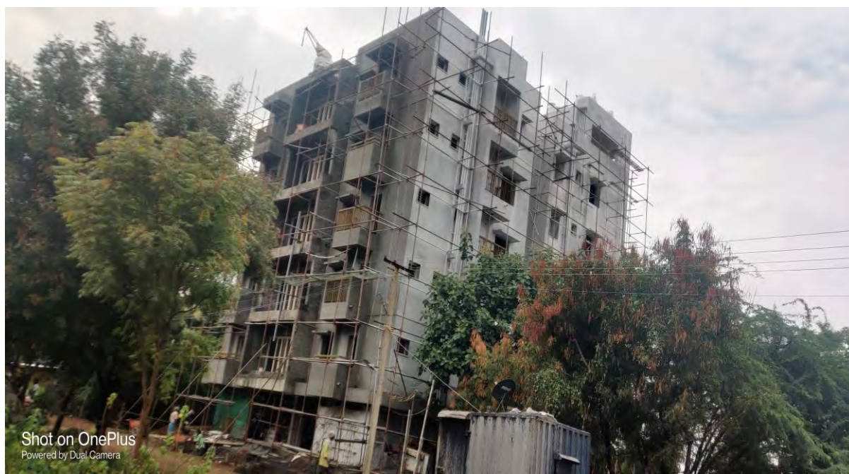
FRONT & SIDE 2 VIEW – 17.06.2021