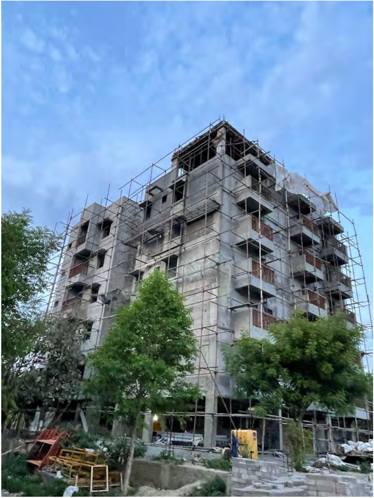
FRONT & SIDE 1 VIEW – 17.06.2021