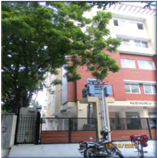
Permanent EB Connection obtained