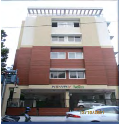
External Finishing work is completed