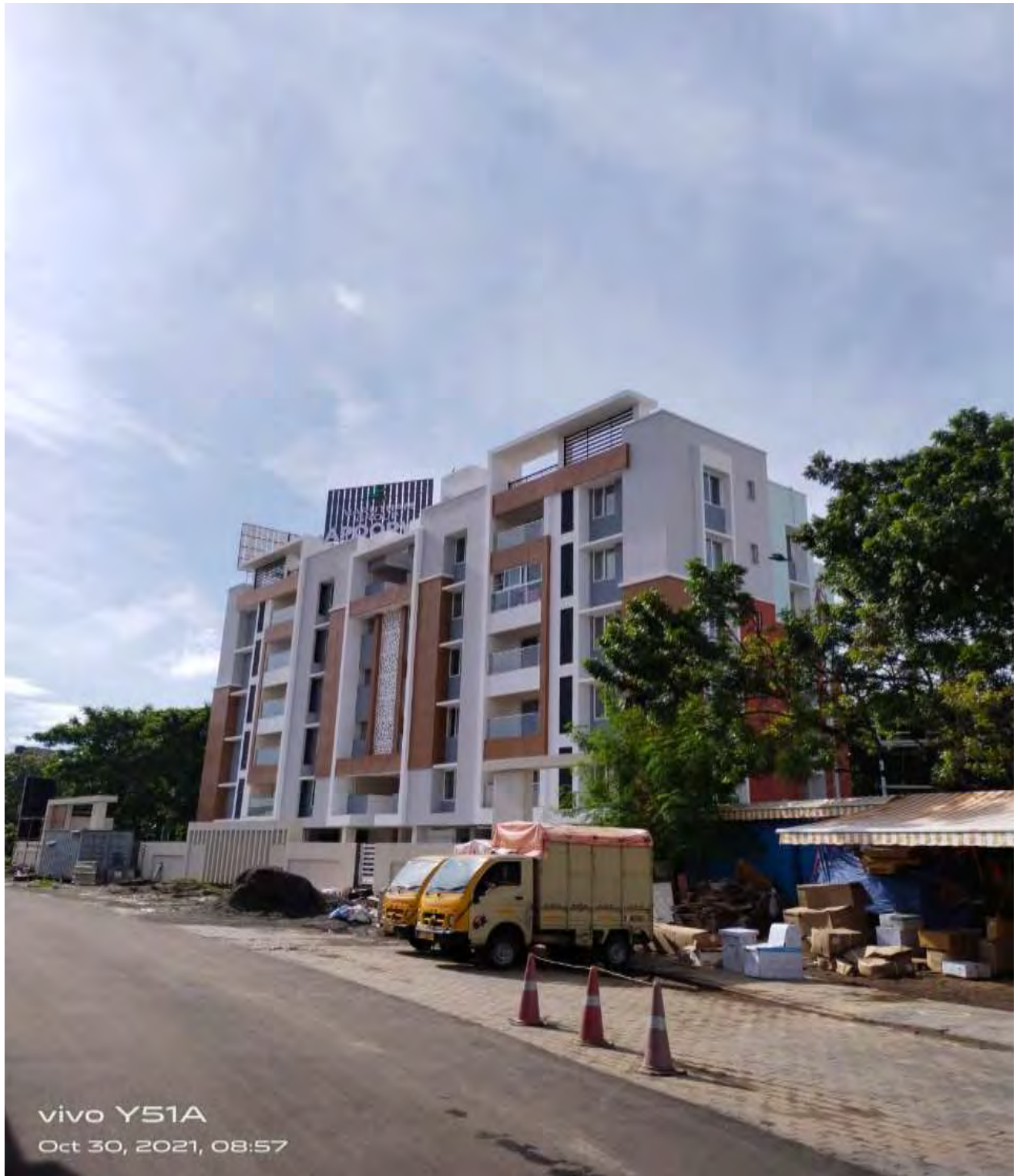
FRONT ELEVATION -2