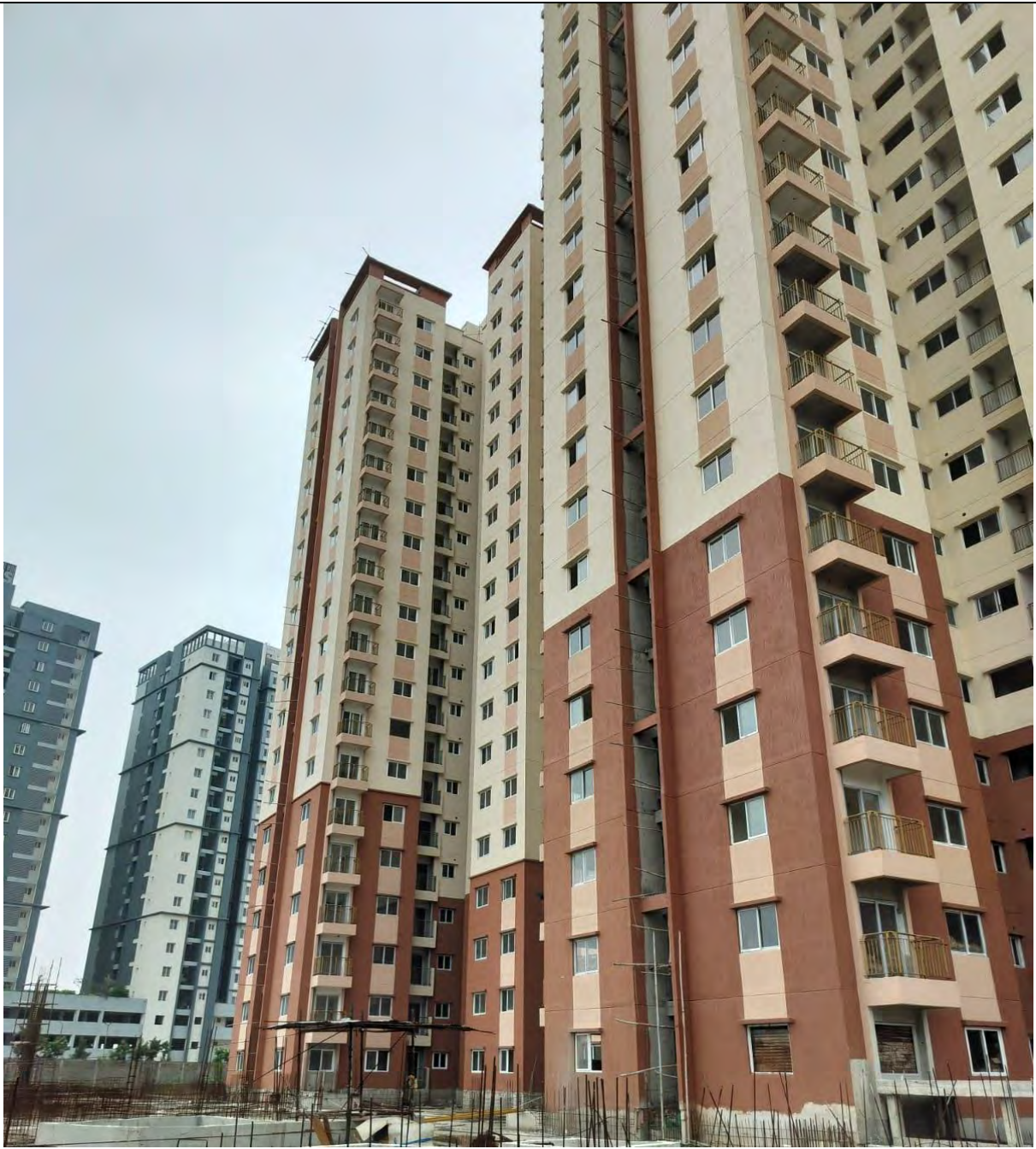
Tower 5A & 5B _ Terrace floor slab completed .Finishing work under progress

This Project is financed by Investcorp Score fund and SWAMIH Investment fund-1.