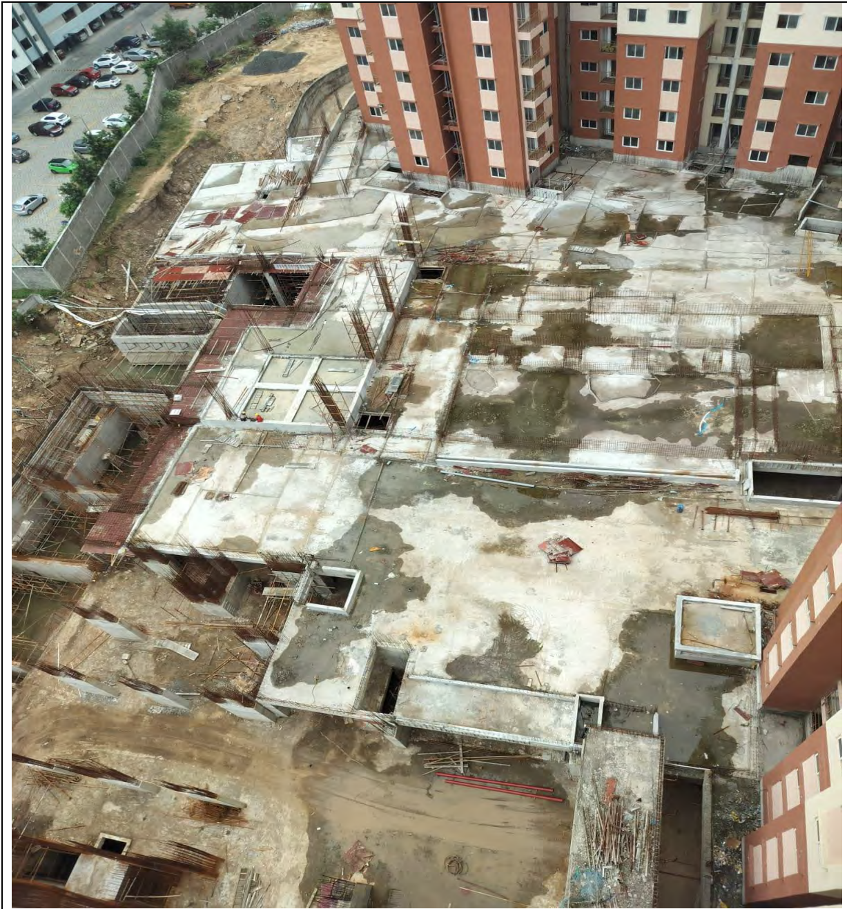
Upper basement work in Progress