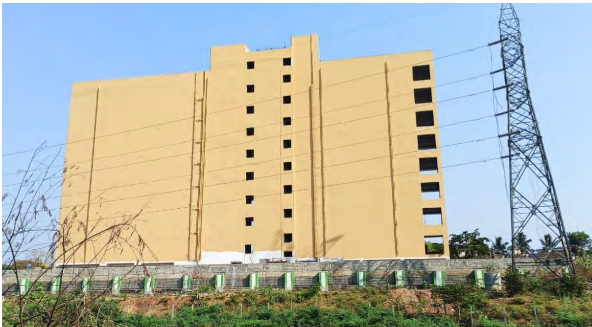
Back view as on 06.07.2024