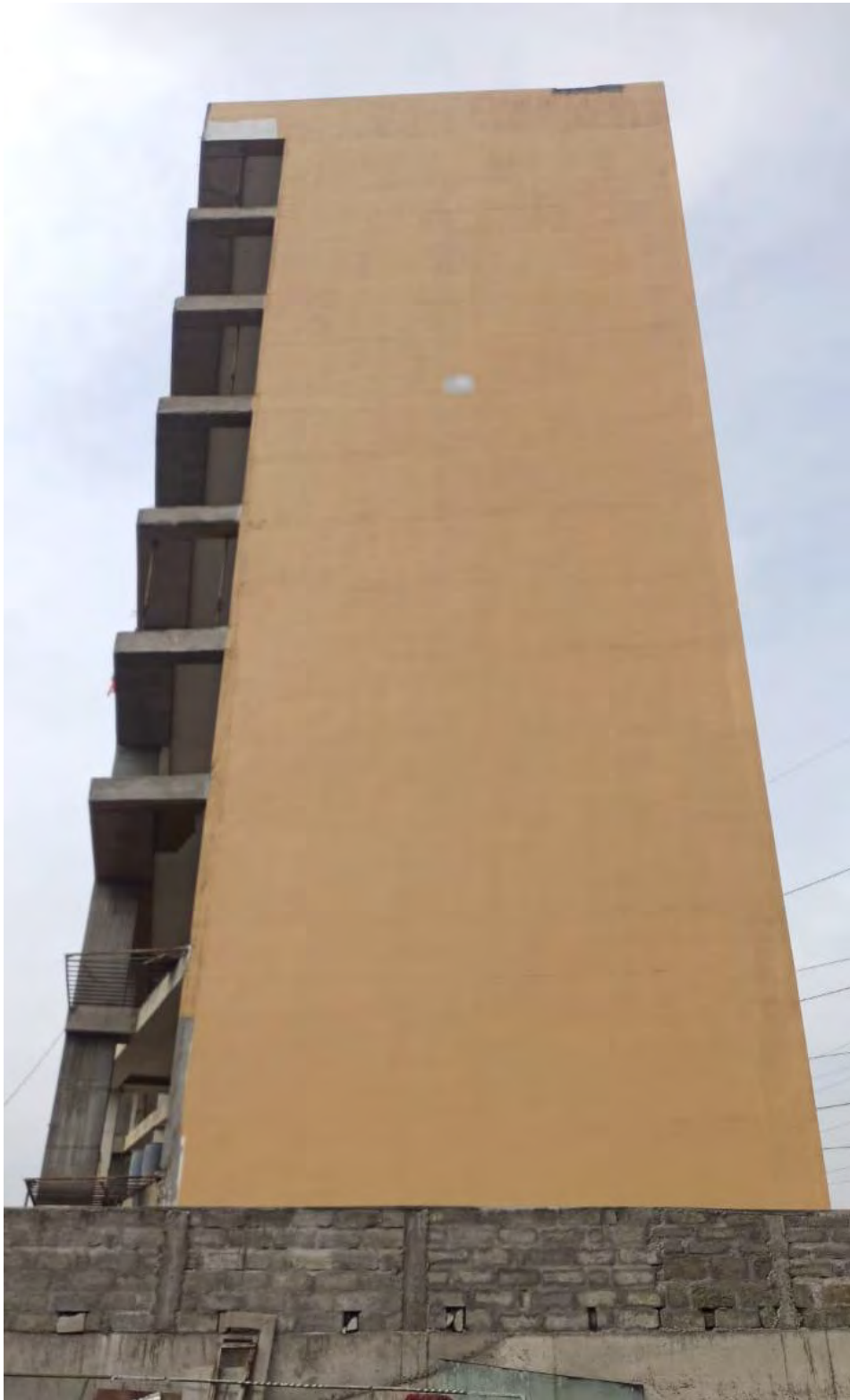
East side view as seen on 06.07.2024