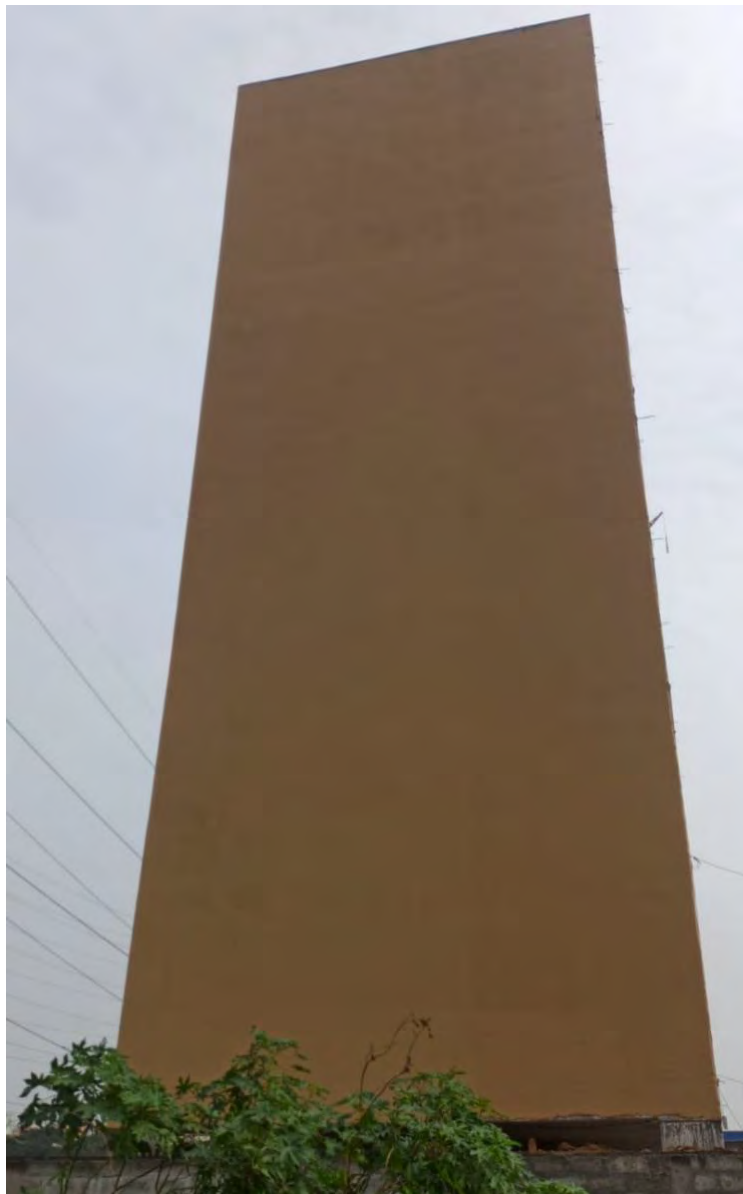
West Side view as seen on 06.07.2024

Note: Mail the above particulars to " reg.tnrera@tn.gov.in "