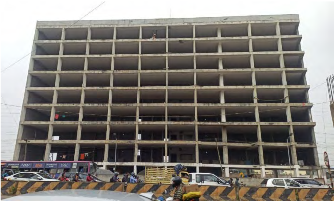
Front view as on 06.07.2024