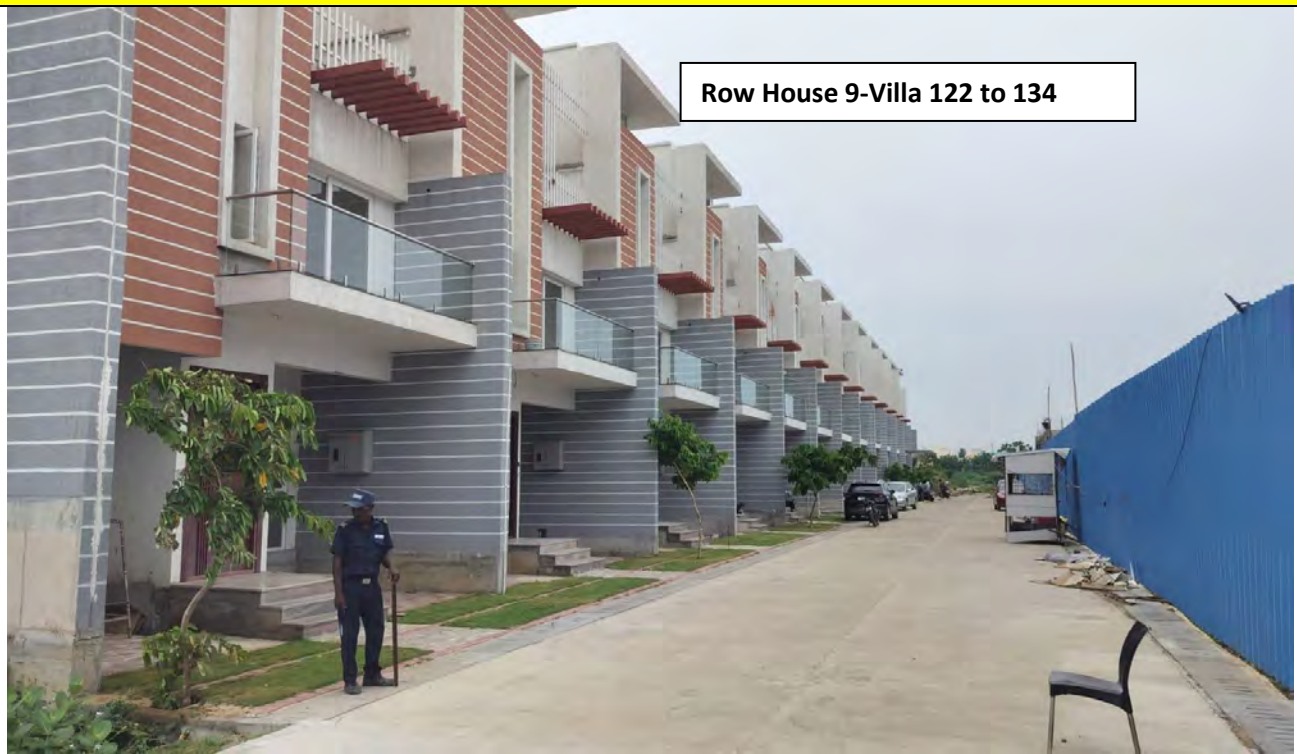
Row House 9 –Finishing work in progress