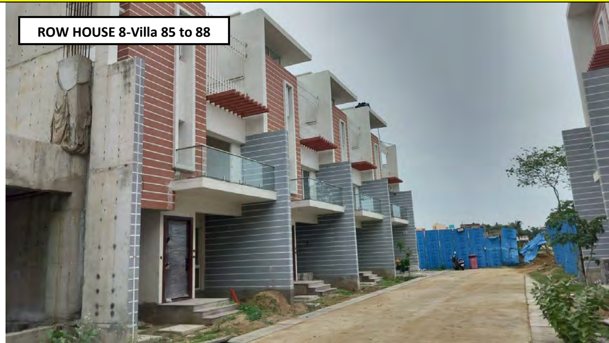
Row house – 8 –finsihing work under progress