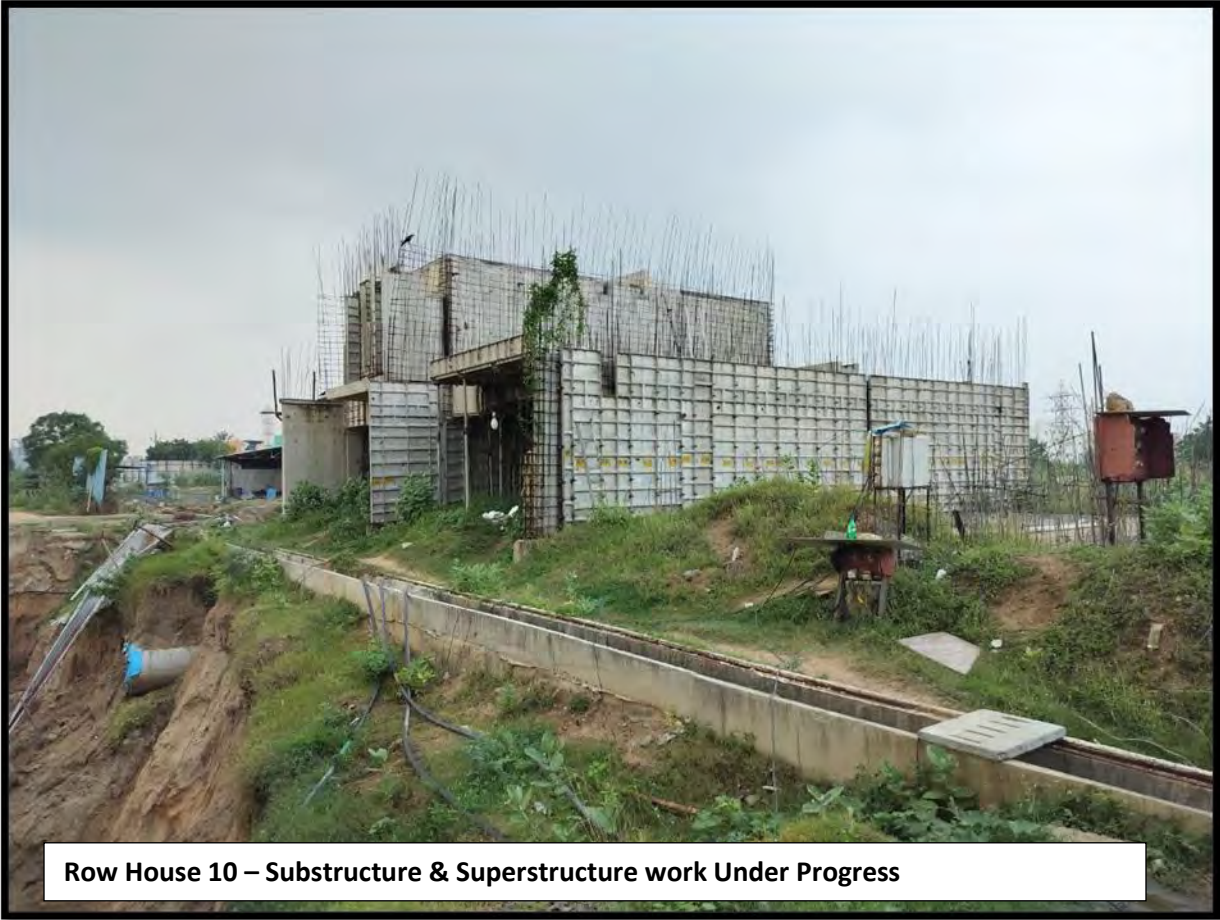
Row House 10 – Substructure & Superstructure work Under Progress