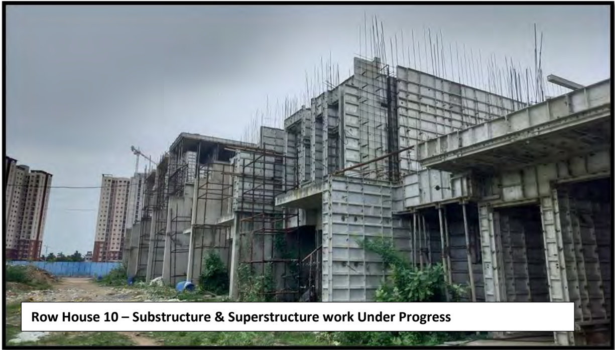
Row House 10 – Substructure & Superstructure work Under Progress