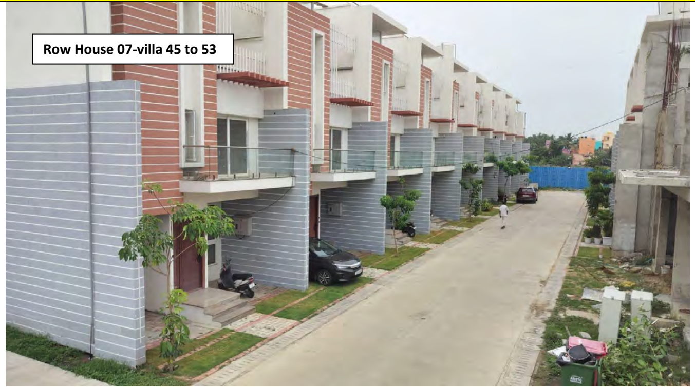
Row House 07-villa 45 to 53