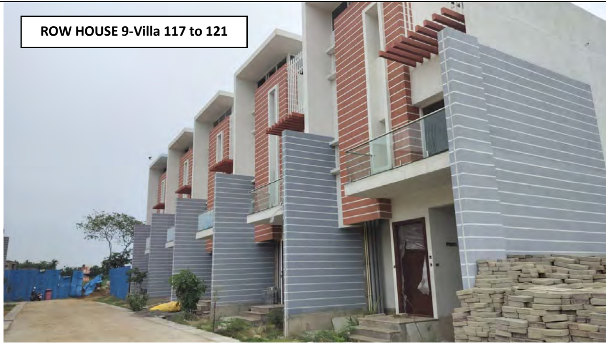
Row house – 9 –Finishing work under progress