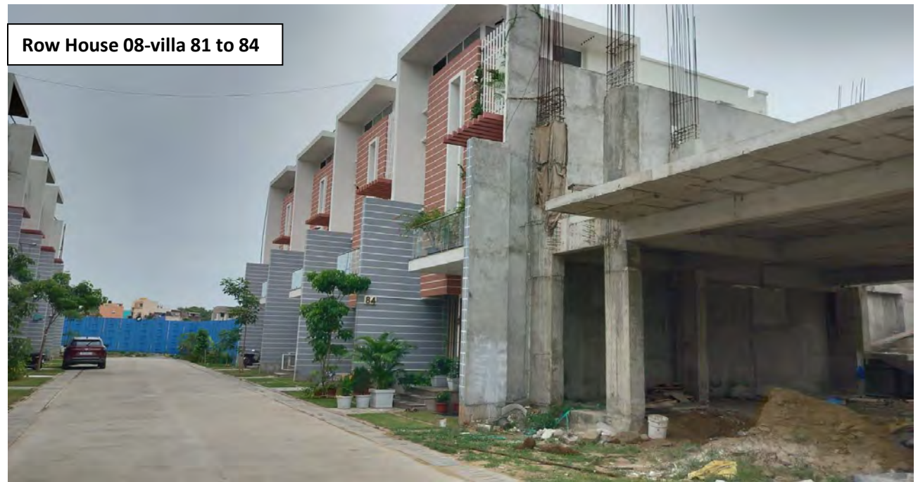
Row House 08-villa 81 to 84