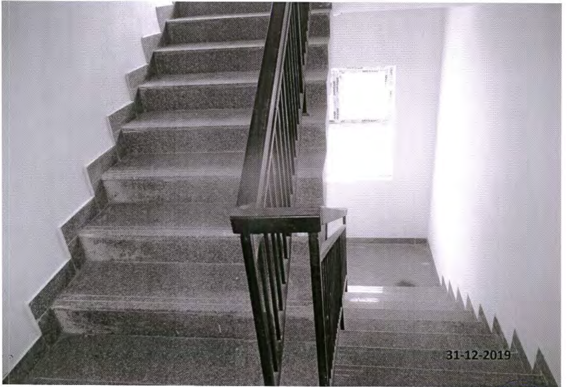
F BLOCK STAIRCASE VIEW