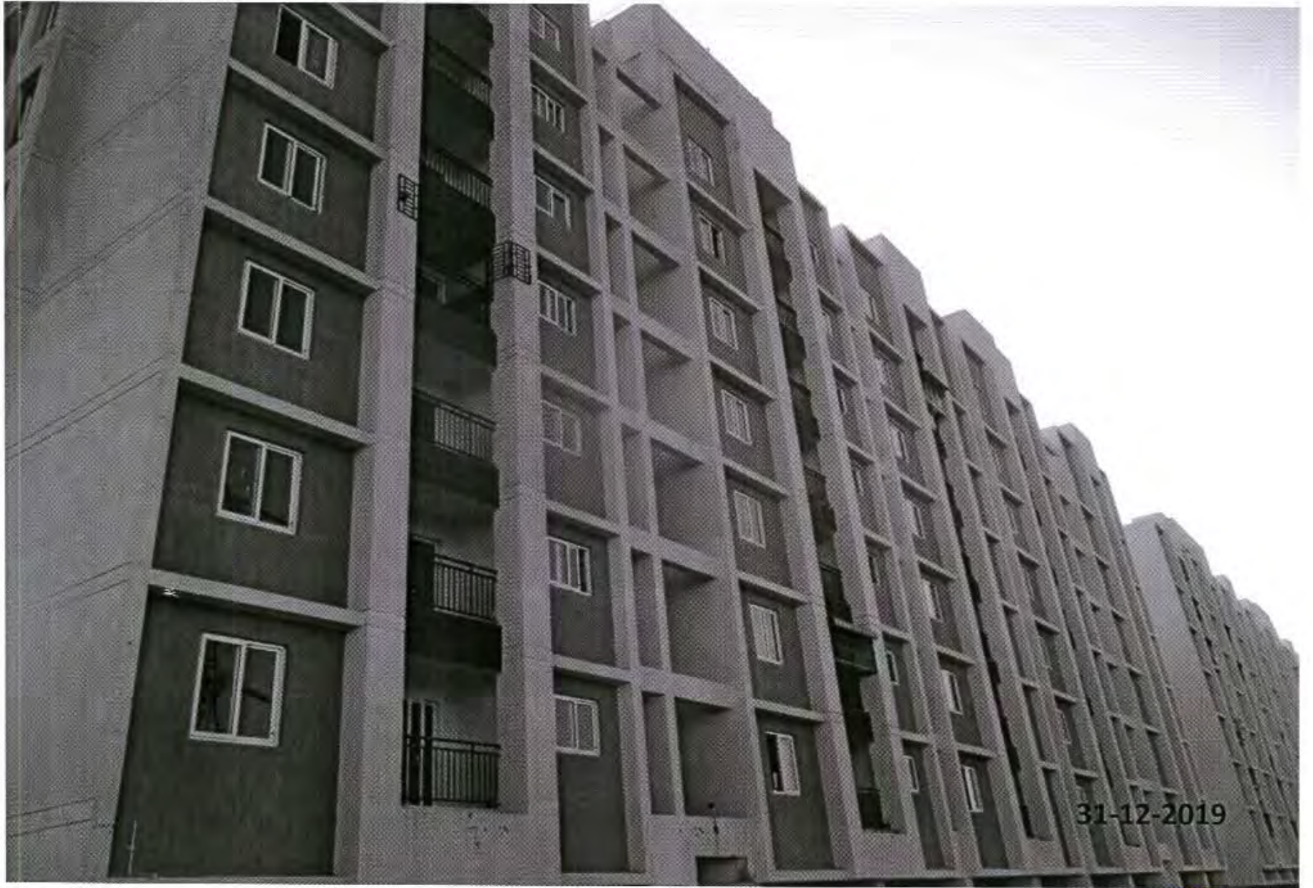
F BLOCK NORTH SIDE VIEW